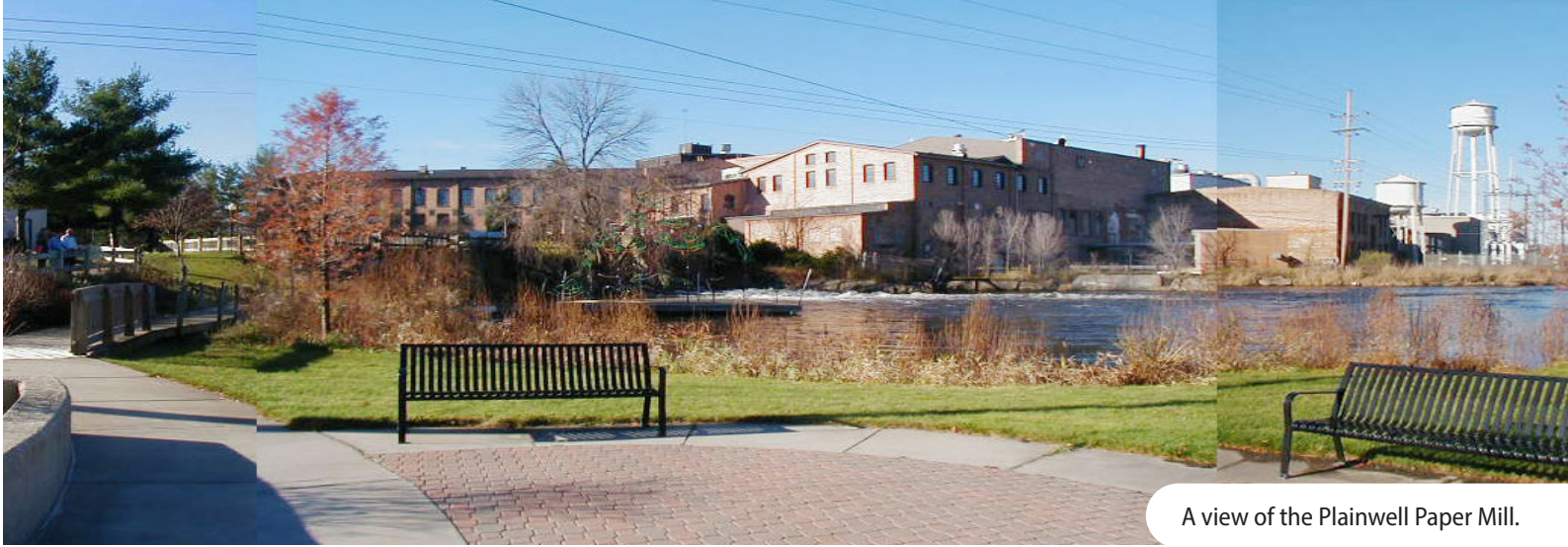
A view of the Plainwell Paper Mill.

"The City is proud of the accomplishments we have made and the partnerships that have formed in propelling this project forward."