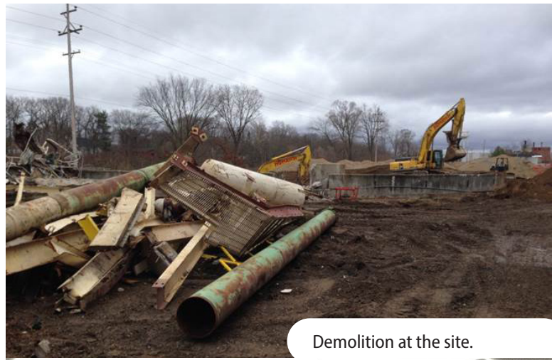
Demolition at the site.

After acquiring the mill property, the City invited proposals from interested developers and chose GHD Services (GHD, formerly ConestogaRovers & Associates) as its partner. The project transformed a former dewatering facility into a new public safety building. In 2012, GHD moved 50 employees into renovated office space in the mill. The City opened its new city hall on site in 2014 and used grant funding to expand parking for employees at the site. Using salvaged material from the mill, the community commissioned a sculpture to represent the mill's rebirth. Renaissance Race is now located near the new main entrance to the mill complex. GHD and city officials remain focused on filling the property with residential and commercial facilities. In 2018, a Sweetwater's Donut Mill restaurant opened on site. The mill itself is now part of a historic district on the National Register of Historic