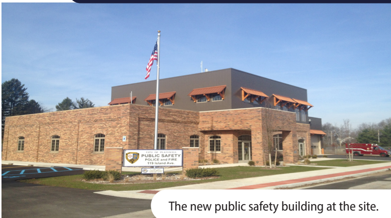
The new public safety building at the site.

For more information see: www.epa.gov/superfund-redevelopment