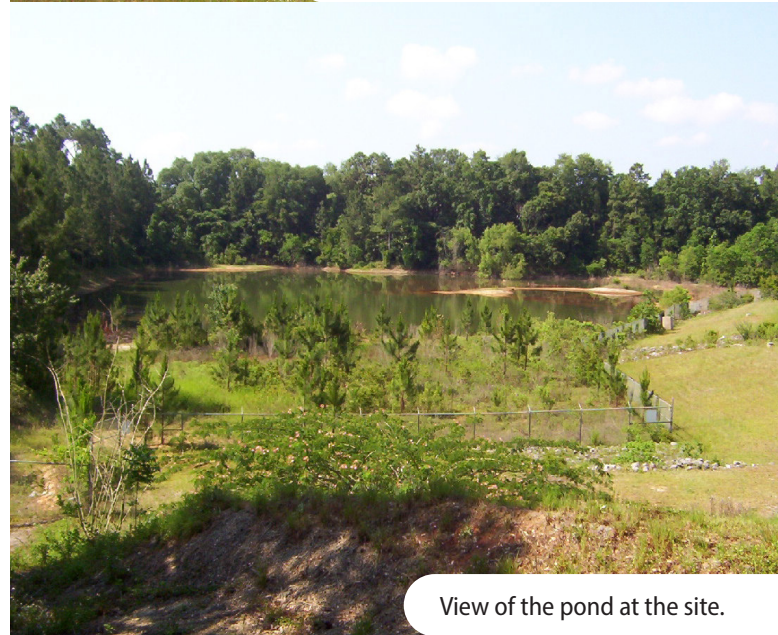
View of the pond at the site.