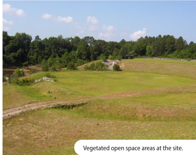
Vegetated open space areas at the site.

Parties interested in acquiring or redeveloping Superfund sites often seek to qualify as bona fide prospective purchasers. EPA Region 4 assists qualified prospective owners and developers with this effort, coordinating with state agencies, local governments and site owners. EPA Region 4 will also coordinate with all parties to make sure that reuse plans are compatible with the site's remedy.