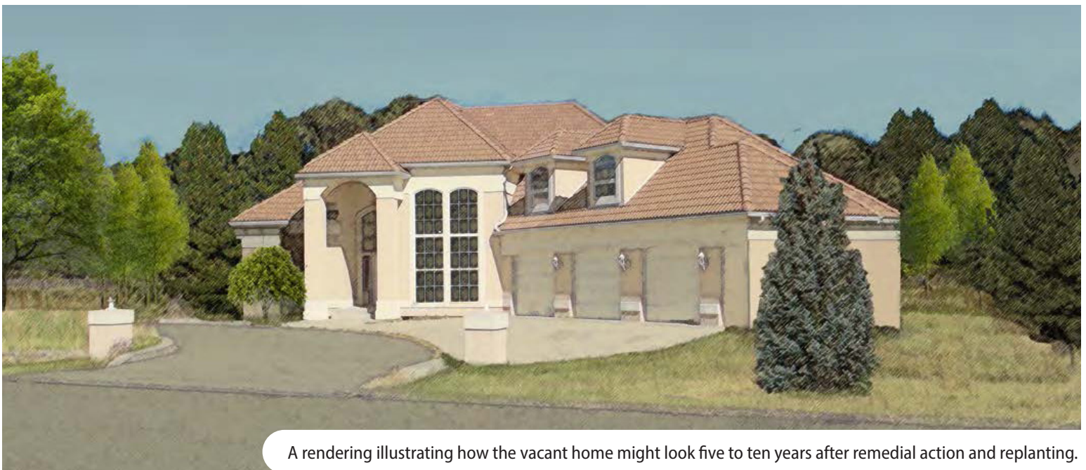
A rendering illustrating how the vacant home might look five to ten years after remedial action and replanting.

After initial efforts to remove contamination were not effective for long-term protection of human health, EPA added the site to the Superfund program's National Priorities List in 2011. The same year, EPA selected the site's long-term remedy in the site's Record of Decision. The selected remedy includes excavation and consolidation of asbestos-contaminated materials in on-site repositories, placement of a marker layer to prevent future digging below the deepest extent of excavation, and placement of caps and clean fill over excavated areas.