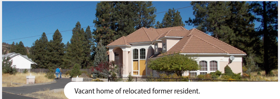
Vacant home of relocated former resident.