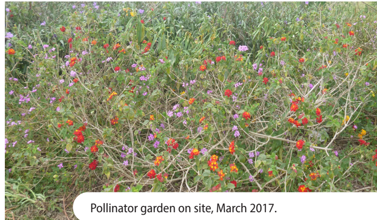
Pollinator garden on site, March 2017.

In 2013, EPA Region 4 recognized site PRPs with its Excellence in Site Reuse Award for the revitalization and ecological reuse of the site.