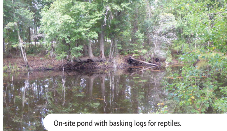
On-site pond with basking logs for reptiles.