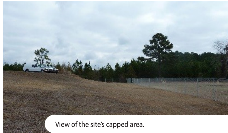
View of the site's capped area.

On the southern part of the site, Hercules is working with Wildlife Habitat Council on a Conservation Certification for the pond area. The company has installed basking logs and cover boards to attract insects and reptiles. So far, motion-sensing cameras have recorded raccoons, foxes, squirrels and large birds at the site. Hercules has also been working with the College of Coastal Georgia on a partnership that will bring students and faculty to the site for plant and animal research.