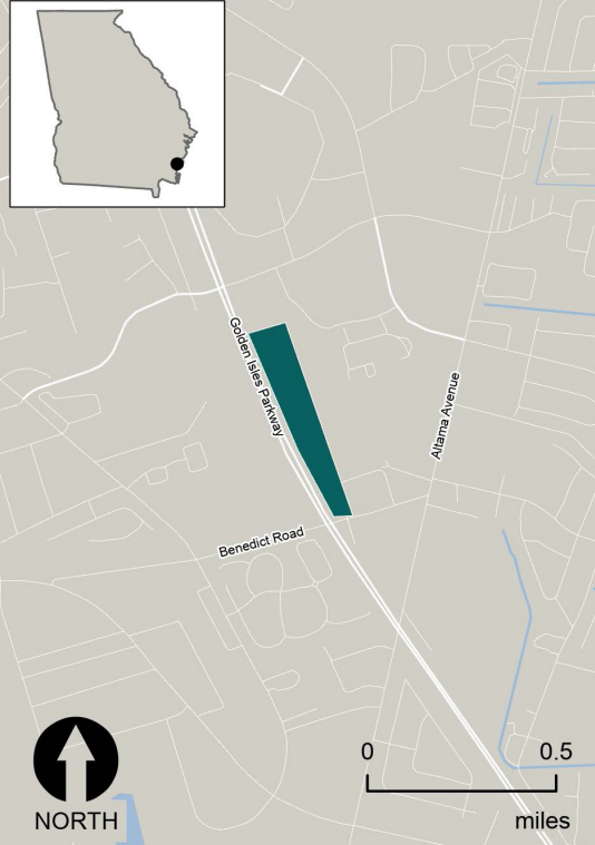
Location of the site in Georgia.