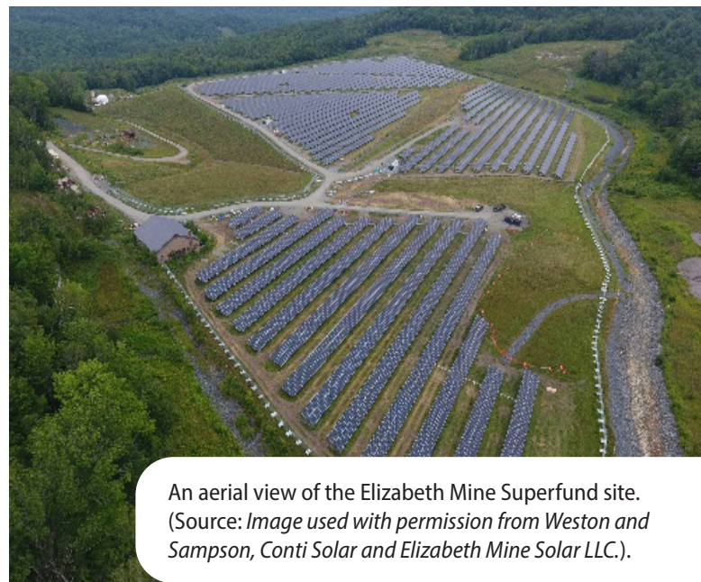
An aerial view of the Elizabeth Mine Superfund site.

In addition to green remediation and ecological restoration work at the site, EPA worked closely with the state of Vermont and the Strafford Historical Society to make sure historic mining artifacts and structures were recovered, preserved and documented during cleanup, as well as created historical interpretive signs and educational materials explaining the history of the site. The state of Vermont conserved artifacts including furnace parts, lead sheets and pipes, glass and nails. In 2017, developers completed construction of a 7-megawatt solar farm on the site. The facility's 19,990 solar panels rest on a ballast rack system to protect the site's capped area; the solar farm provides enough electricity to power 1,200 homes annually. Cleanup has provided a way for the site to serve as a source of clean energy as well as enabling ecological revitalization and historic preservation, providing long-term community benefits.