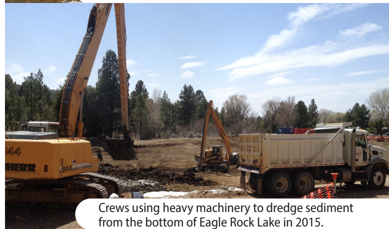
Crews using heavy machinery to dredge sediment from the bottom of Eagle Rock Lake in 2015.