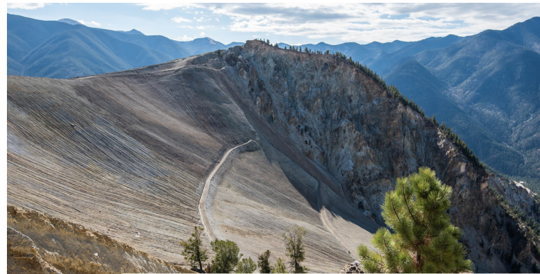
View overlooking part of the Chevron Questa Mine site.