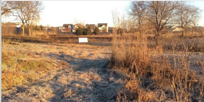
View of part of the site before excavation.