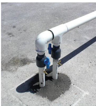
Pipes transport vapors from the underground SVE extraction well to treatment.

SVE and air sparging are efficient ways to remove VOCs above and below the water table. Both methods can help clean up contamination under buildings and cause little disruption to nearby activities when in full operation. SVE and air sparging have been selected for use at Superfund sites and other cleanup sites across the country.