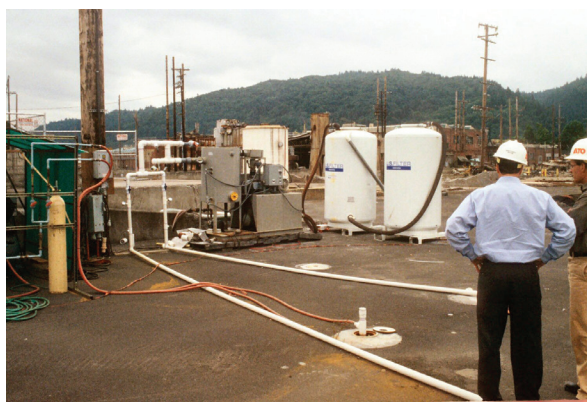
Aboveground treatment system includes two tanks of activated carbon.

NOTE: This fact sheet is intended solely as general information to the public. It is not intended, nor can it be relied upon, to create any rights enforceable by any party in litigation with the United States, or to endorse the use of products or services provided by specific vendors.