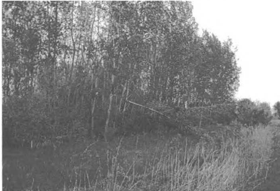
Picture 5 – Example of damaged trees in far western phytoremediation plot