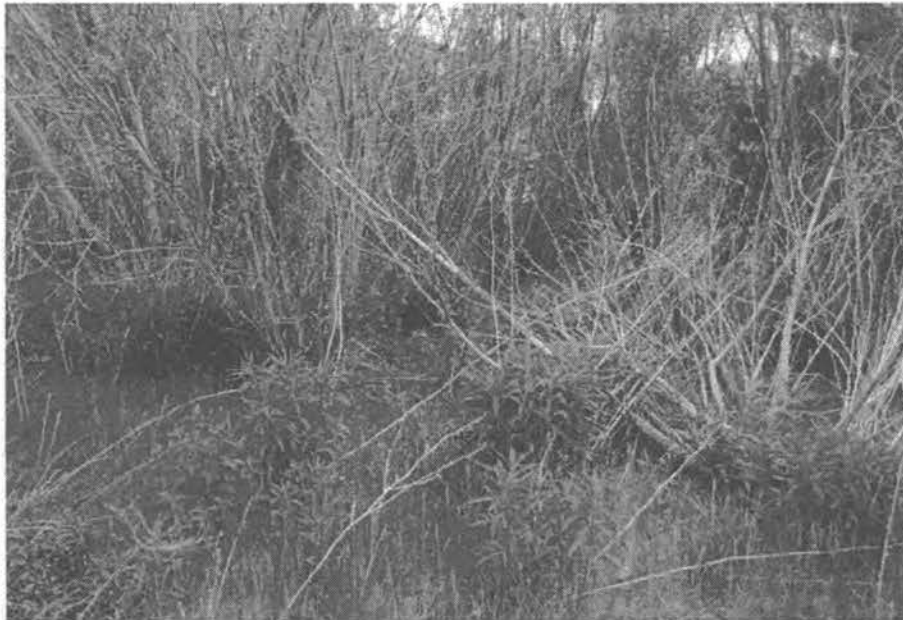
Picture 1 - Example of dead/broken trees near treatment building

The site in general is in good condition. The grass and weeds are slightly overgrown. Some of the phytoremediation plot trees are dead/broken/overgrown. Paths in the grass of the unfenced area indicate trespassing is a common occurrence.