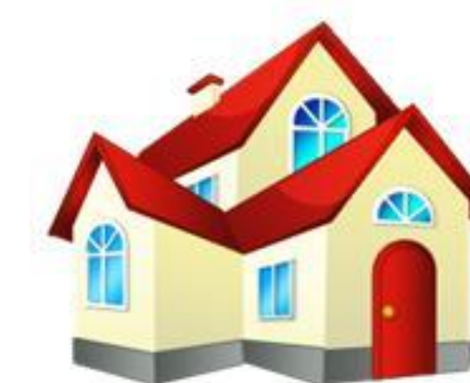
Residential Land Use