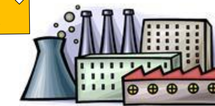
Industrial (Indoor worker)