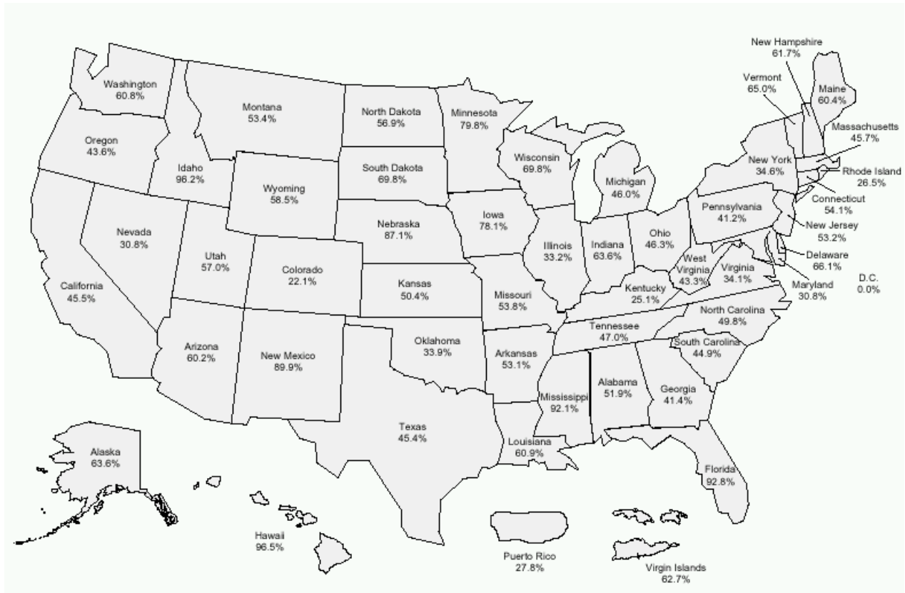
Figure 1 Ground Water Use by States (Solley et. al, 1998)