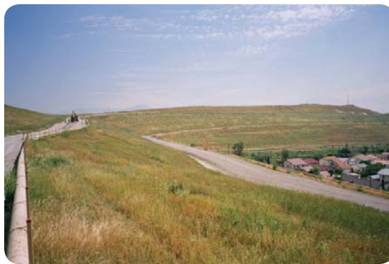
Spring grasses grow on the cap of a hazardous waste landfill.

Capping is the traditional method for isolating landfill wastes and contaminants. It sometimes is used to address large volumes of soil or waste with low-levels of contamination. Caps made of asphalt or concrete, or even a layer of soil planted with grass, can allow some sites to be reused. Caps have been selected for use at many Superfund sites across the country.