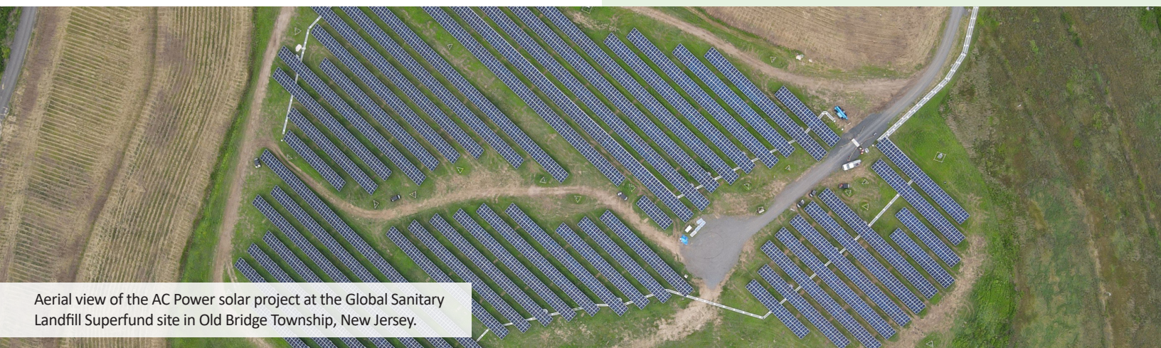
Aerial view of the AC Power solar project at the Global Sanitary Landfill Superfund site in Old Bridge Township, New Jersey.

The site's potentially responsible parties finished implementing the cleanup plans.