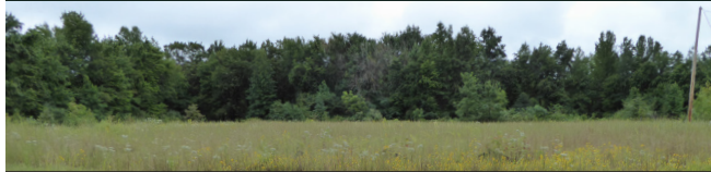
An open grassy area at the site

Use Restrictions Residential uses, the use of groundwater for drinking water and the installation of any wells are prohibited. On-site excavation of soil in former disposal areas is restricted without prior screening for munitions and explosives.