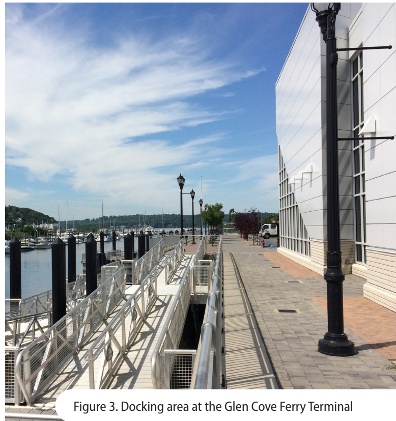
Figure 3. Docking area at the Glen Cove Ferry Terminal

EPA's collaboration with the city and other stakeholders was integral to returning the site to beneficial use. The Li Tungsten Corp. Superfund site is a prime example of how planning and partnerships can turn a formerly contaminated site into a flourishing place to live, work and play.