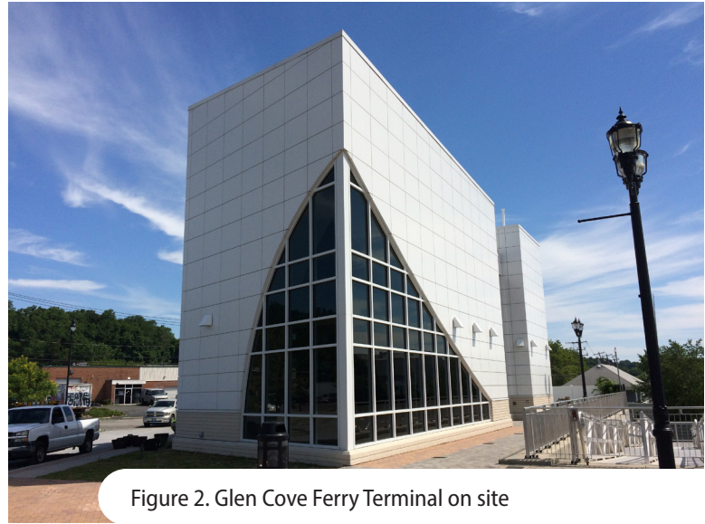
Figure 2. Glen Cove Ferry Terminal on site

Starting in 2002, the city worked with EPA and the