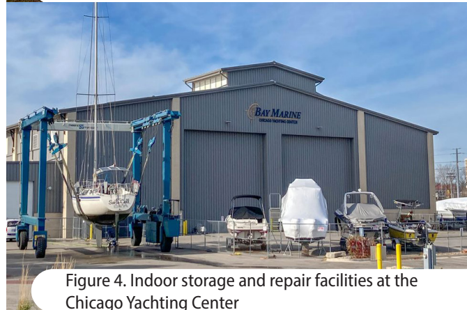
Figure 4. Indoor storage and repair facilities at the Chicago Yachting Center