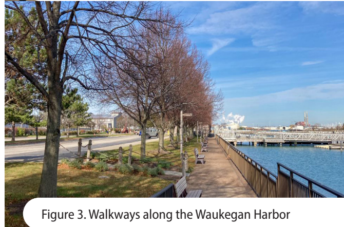
Figure 3. Walkways along the Waukegan Harbor