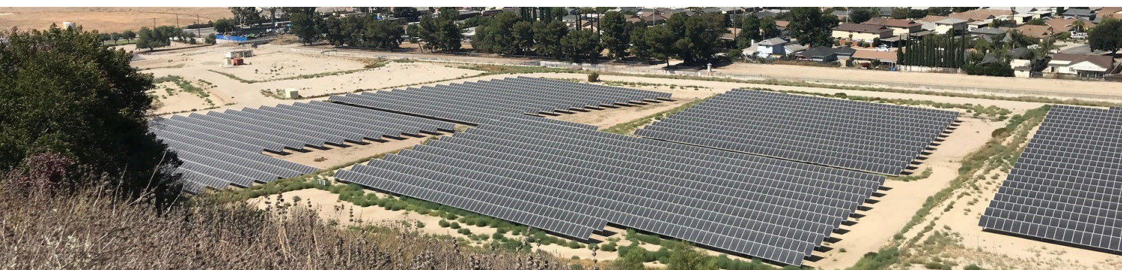
The 11,000-panel solar array at the Pacific Coast Pipeline Superfund site.