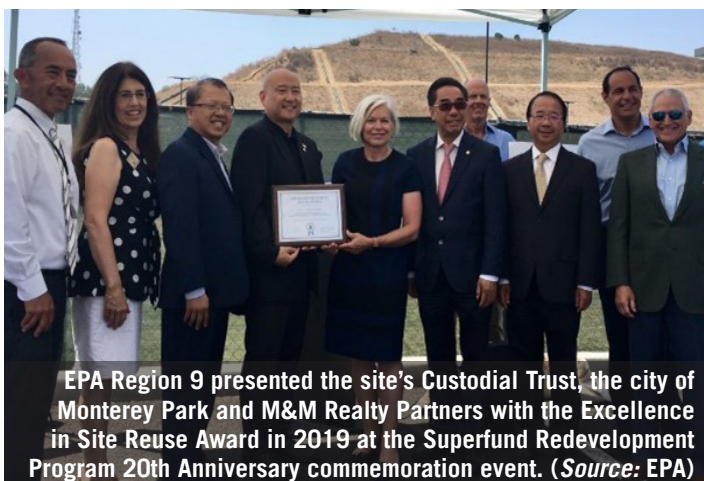
EPA Region 9 presented the site's Custodial Trust, the city of Monterey Park and M&M Realty Partners with the Excellence in Site Reuse Award in 2019 at the Superfund Redevelopment Program 20th Anniversary commemoration event.