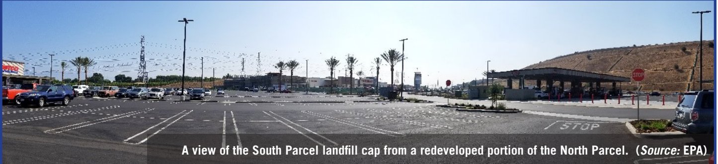
A view of the South Parcel landfill cap from a redeveloped portion of the North Parcel.

Operating Industries Inc. Superfund Site Monterey Park, California