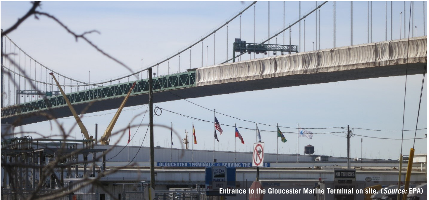
Entrance to the Gloucester Marine Terminal on site.

South Arts District. The organization broke ground on the 96-seat Waterfront South Theatre in April 2008. Its first season in the new theatre began in September 2010. More than 450 people attended the opening three-week run of shows. The facility also hosts a weekly movie night for kids and school plays.