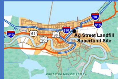
Close proximity to downtown