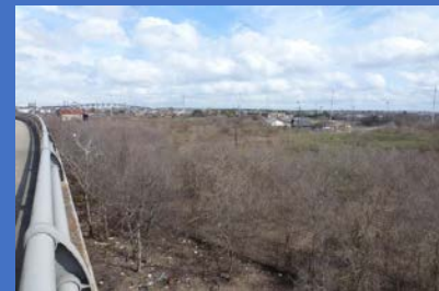
Visibility from Almonaster Ave.