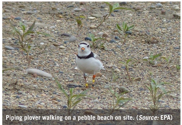
Piping plover walking on a pebble beach on site.

Looking forward, EPA, the U.S. Fish and Wildlife Service, the Illinois Environmental Protection Agency, the Illinois Department of Natural Resources and Johns-Manville are working together to ensure that the family of piping plovers can continue to thrive. Johns-Manville protects the birds during cleanup activities, installing fences and barriers to prevent them from entering work areas, and posts notices reminding workers of the birds' presence. Staff from the Illinois Department of Natural Resources and community volunteers closely monitor the birds' health and activities. Ongoing collaboration among project partners has resulted in the site's successful cleanup and made possible the area's reuse as a valued ecological resource.