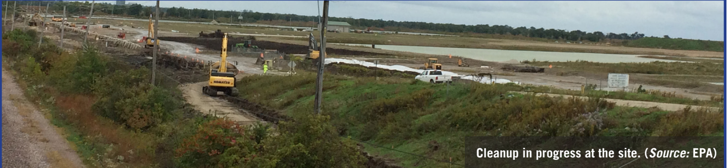
Cleanup in progress at the site.

Site Location: Greenwood Avenue, Waukegan, Illinois 60085