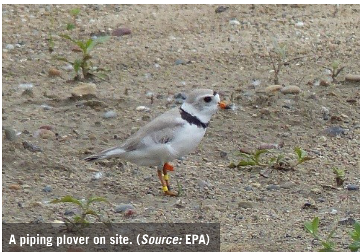
A piping plover on site.

Tom Bloom | (312) 886-1967 bloom.thomas@epa.gov