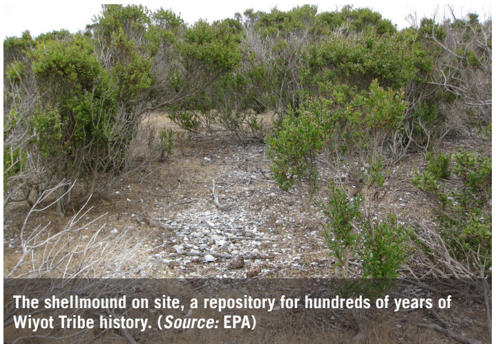
The shellmound on site, a repository for hundreds of years of Wiyot Tribe history.

EPA continues to take action to address tribal concerns. In January 2017, EPA issued a memorandum (available at https://semspub.epa.gov/src/document/HQ/500024668.pdf ) providing recommendations for considering tribal treaty rights, treaty-protected resources and traditional ecological knowledge during Superfund activities.