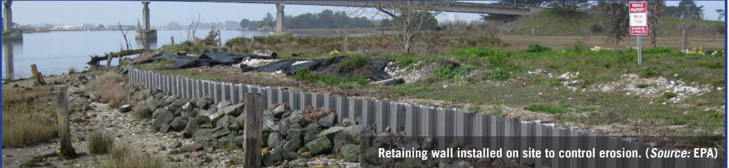
Retaining wall installed on site to control erosion.

Site Location: half-mile north of Eureka on Indian Island in Humboldt Bay, California 95502