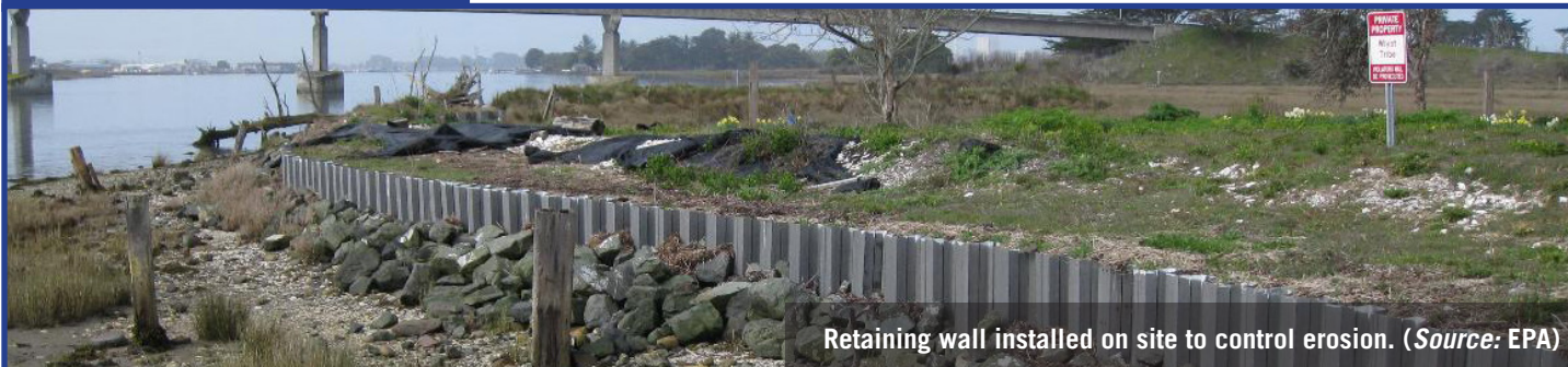
Retaining wall installed on site to control erosion.

Site Location: half-mile north of Eureka on Indian Island in Humboldt Bay, California 95502