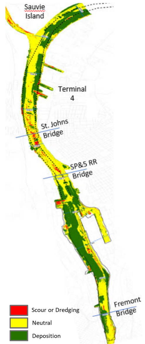
Preliminary bathymetry results from the Pre-RD Remedial Footprint Report.

Deposition and erosion areas vary across the site. The site is net depositional – there are more areas under deposition than scour. Areas with deposition and erosion are similar to those in previous surveys. Most of the deposition is in areas identified for Monitored Natural Recovery (MNR) in the ROD.