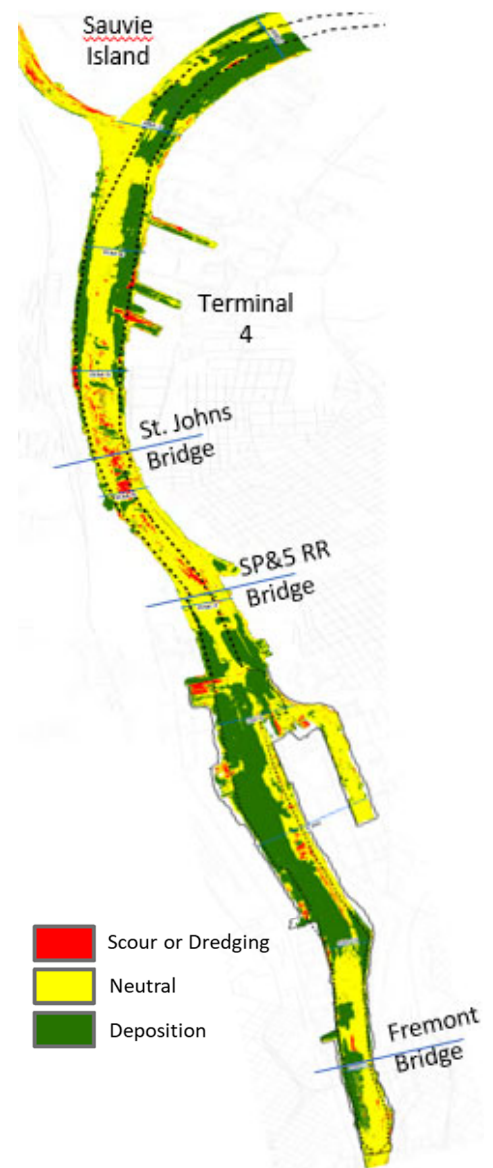
Preliminary bathymetry results from the Pre-RD Remedial Footprint Report.