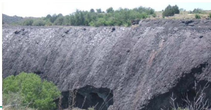
Figure 3: Smelter slag hanging over Agua Fria River