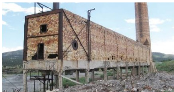
Figure 2: Smelter with tailings pile in background