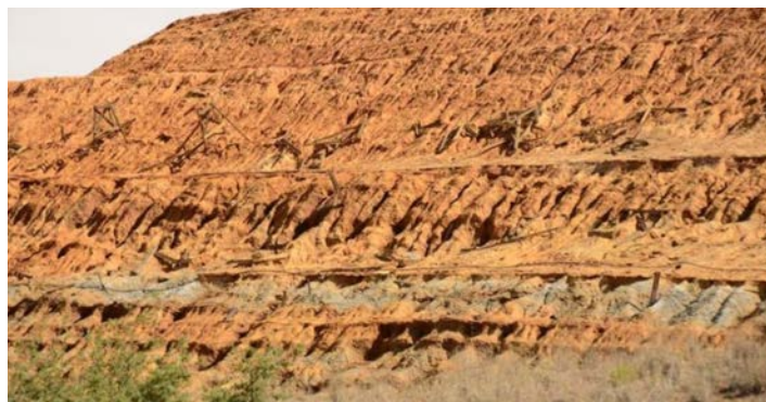
Figure 1: Former Iron King Mine tailings pile

Both properties contain chemical hazards from toxic metals that could pose a health risk. Trespassers are likely to contact waste material including mine tailings, which contain high levels of arsenic and lead.