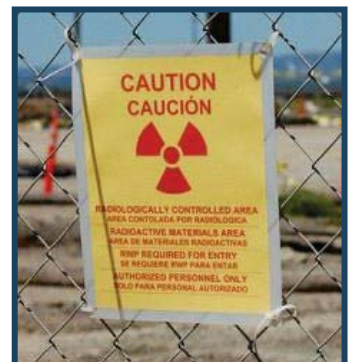
Warning signs are posted outside of radiological work

The Navy is taking numerous safety measures to protect onsite workers, tenants, and the surrounding communities. The Navy posts signs around the perimeter of the radiological work areas to notify the public of the ongoing work (see right); their presence does not mean unacceptable exposure to radiation is occurring for people who are outside of these secured areas. Onsite workers wear personal dosimeters to measure their cumulative exposure to radiation while working in known radiation areas for multiple days. The dosimeters measure radiation exposure and are used regularly to ensure workers are not exposed to unsafe amounts of radiation.