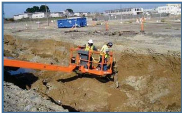
Soil samples being collected for testing