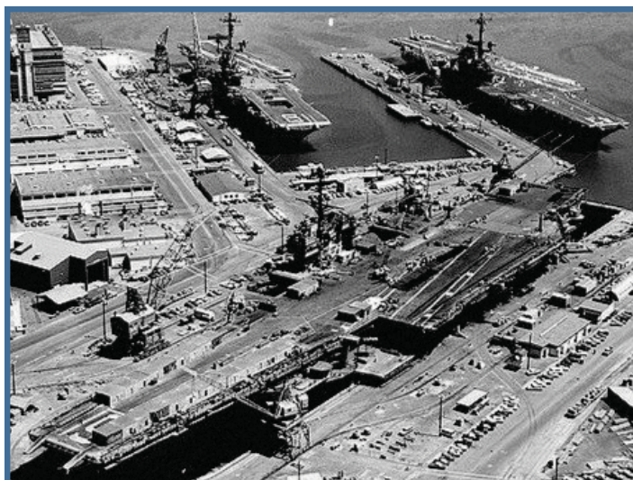
USS Ranger, Hancock, and Coral Sea docked at HPNS

The Navy has been evaluating and cleaning up sites with possible radiological contamination at HPNS since 2004. Cleanup areas include buildings, sanitary sewer and storm drain lines, former disposal areas, piers, and ship berths and primarily consist of surveying and removal.