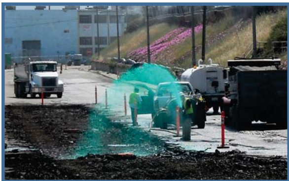
Misting system to help control worksite dust

Navy contractors are required to follow the HPNS Base-wide Dust Control Plan for all earth-moving activities.