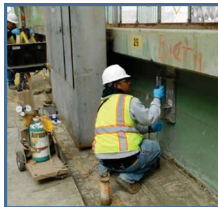
Radiological scanning of building walls