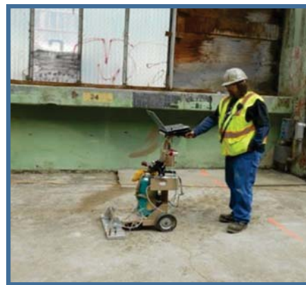
Radiological scanning of building floor

Trucks hauling non-radiological material off base are required to go through a portal monitor to protect against the inadvertent shipment of radioactive material. The portal monitor is one of several measures the Navy has to ensure