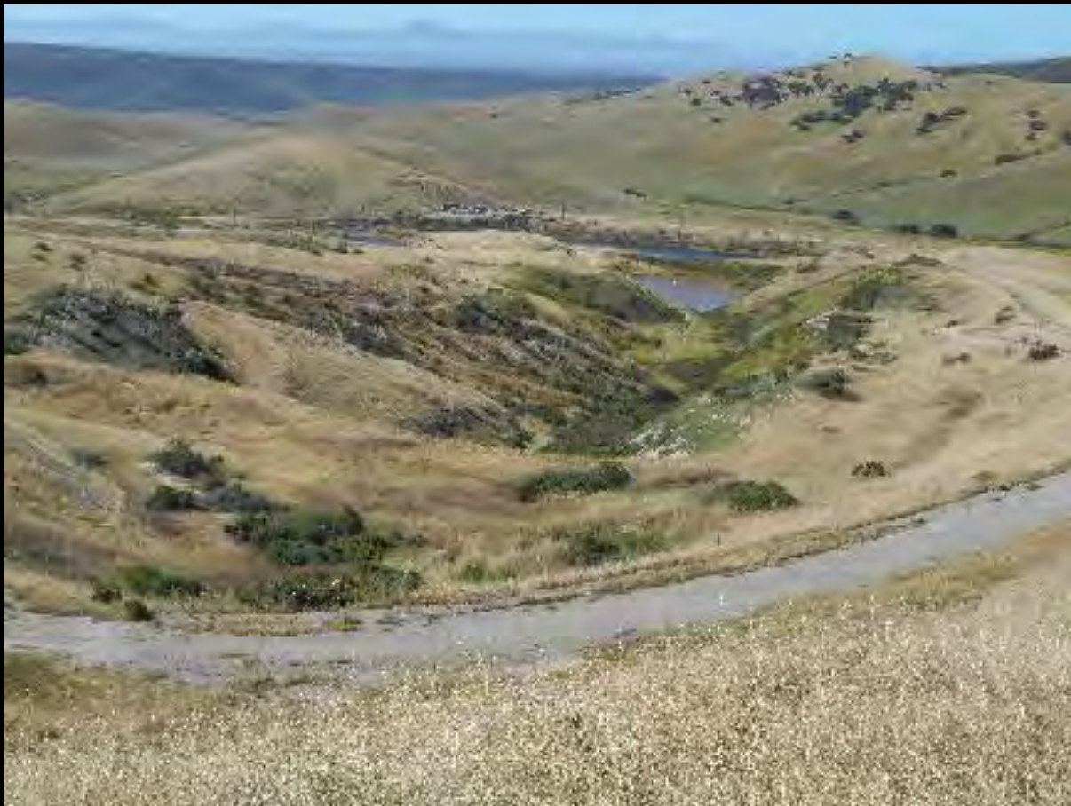
RCRA Canyon, looking south toward Pond A-5 and A-Series Pond .