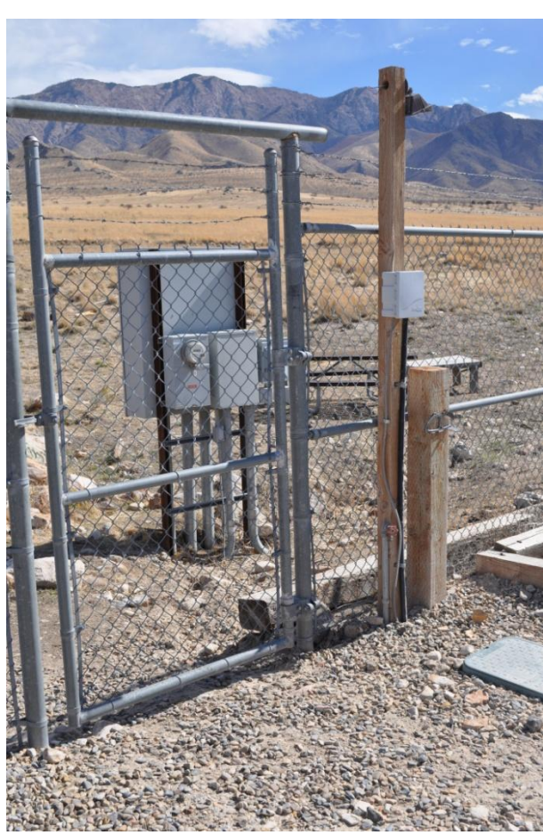
Enclosure gate and electrical panel.