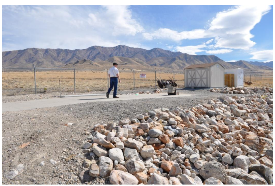
View towards SE corner of compound along eastern enclosure fence.