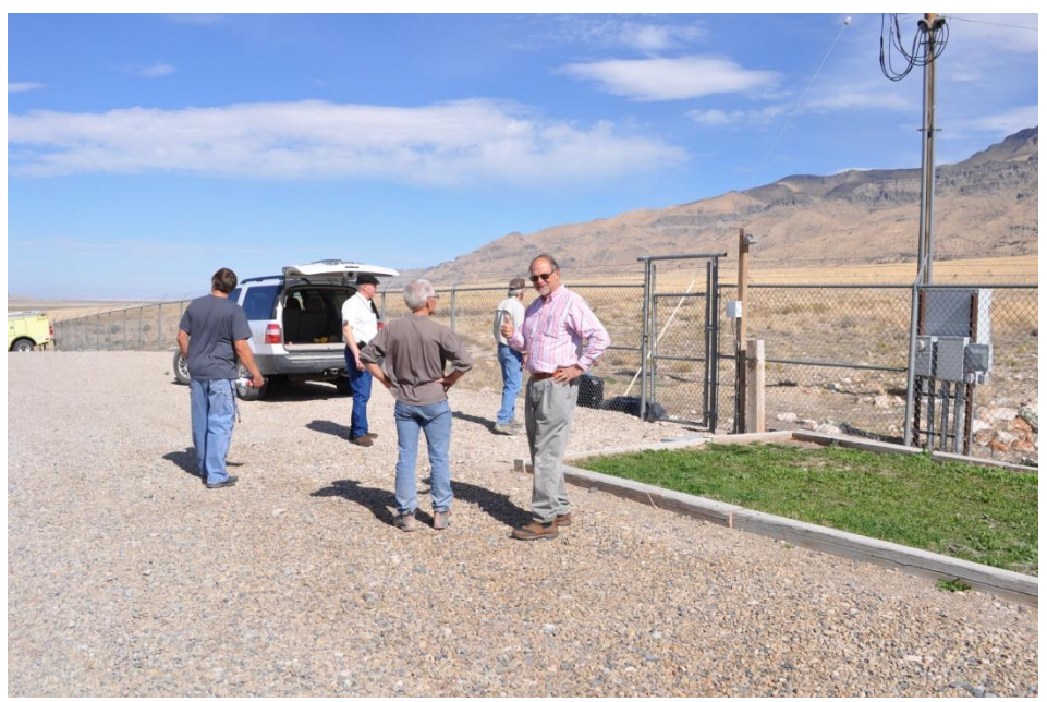
View along of pad area along eastern enclosure fence & gate near electrical panel.