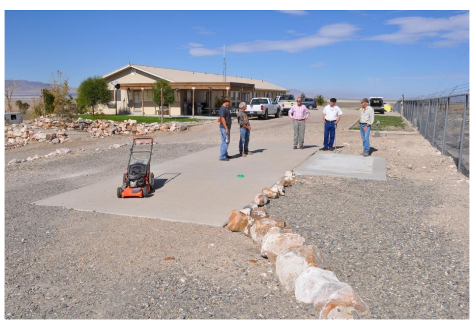
View to N along eastern enclosure fence of pad area.