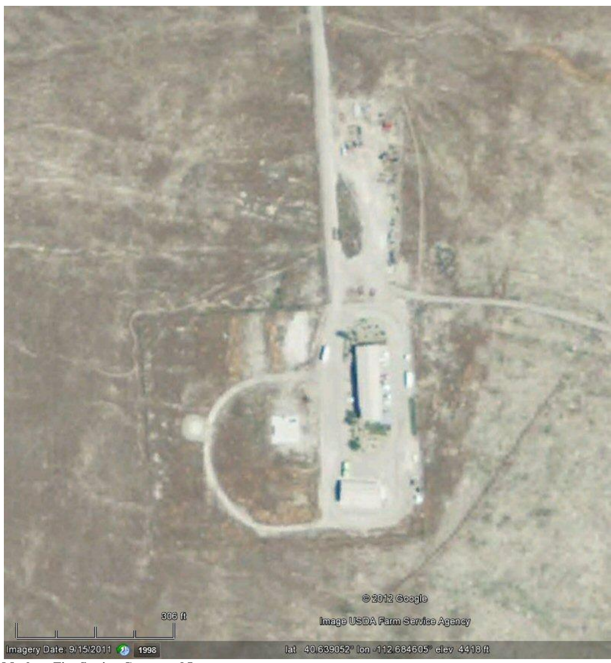
Muskrat Fire Station Compound Layout