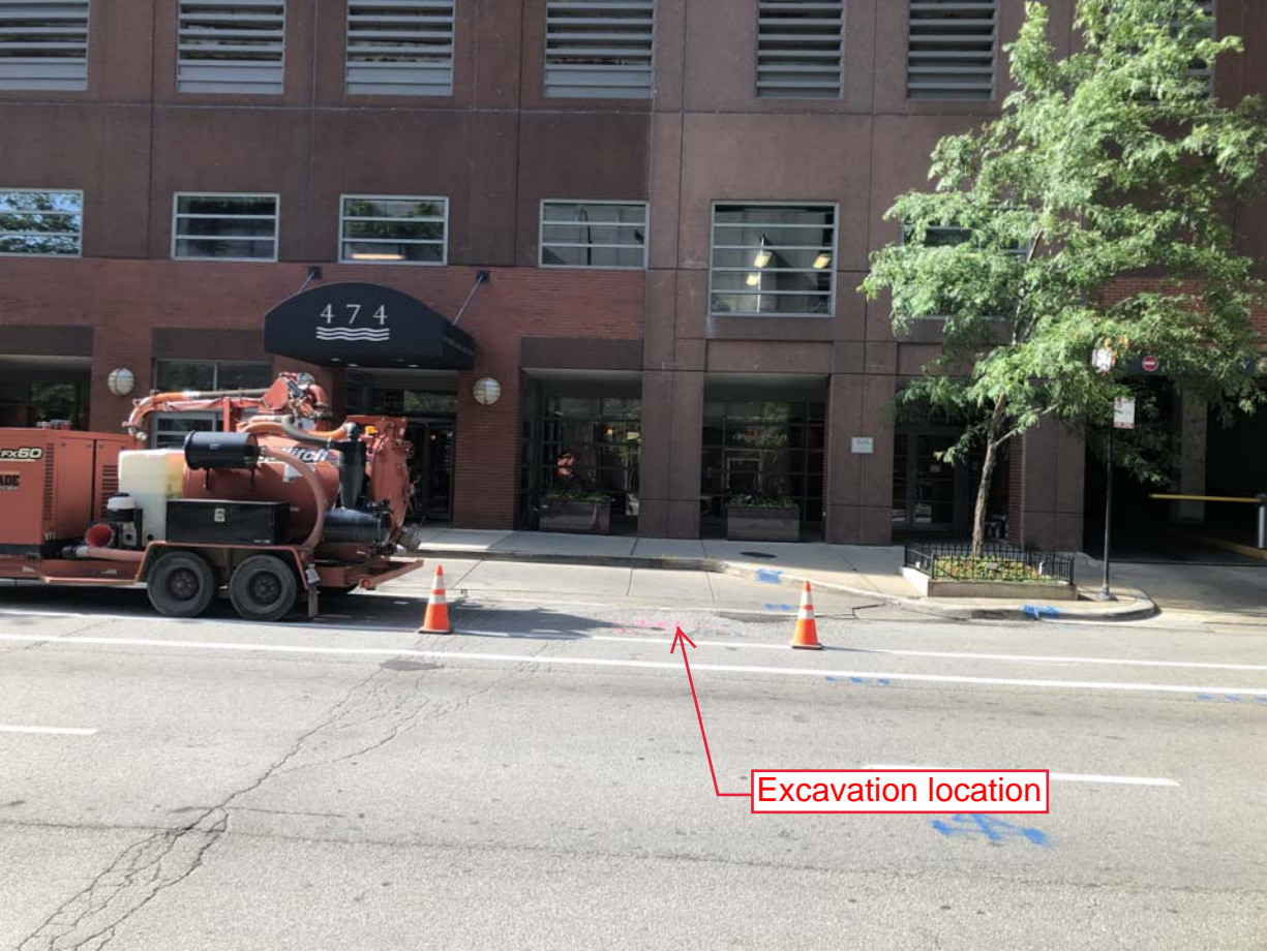
Photograph looking south across E. Illinois St. at the keyhole opening location.