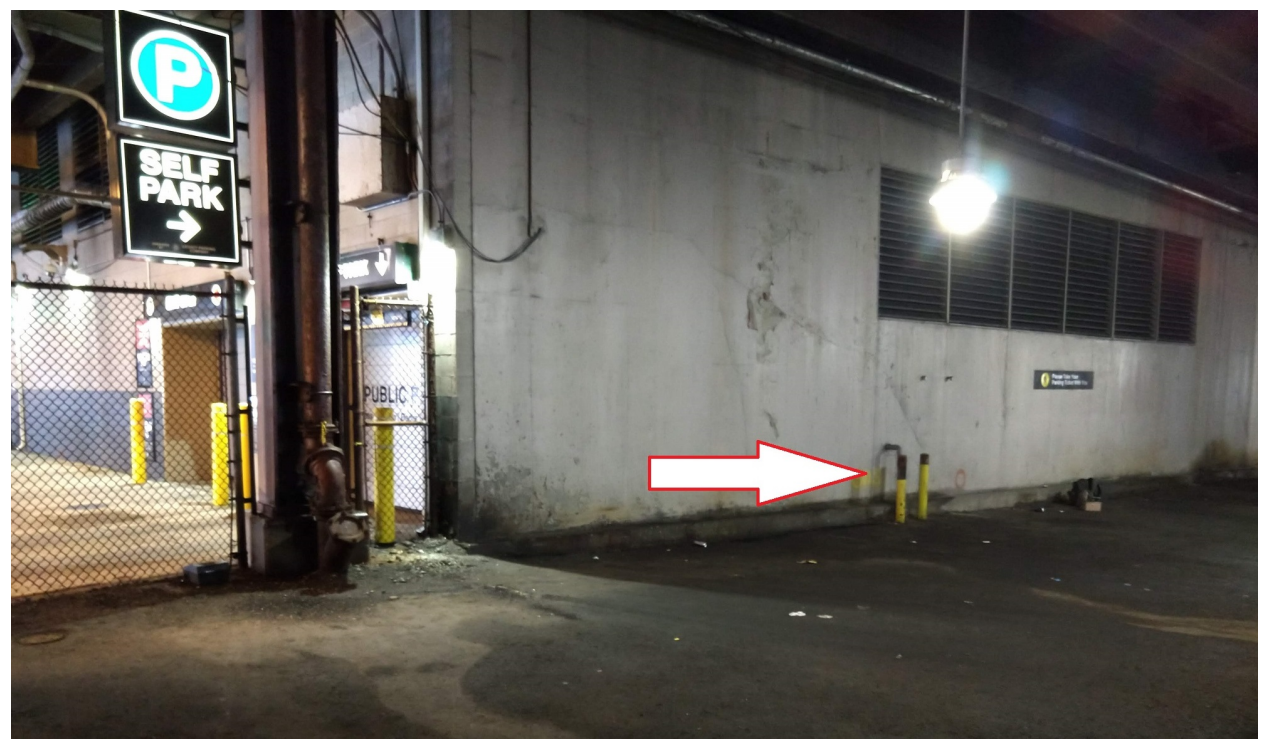
PICTURE 1: VIEW OF THE CORROSION PROTECTION EXCAVATION IN THE LOWER LEVEL OF 454 N. COLUMBUS.