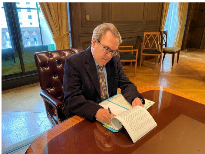
U.S. EPA Administrator Andrew Wheeler signs the amended 2012 cleanup plan for the former West Calumet Housing Complex in Zone 1.

On March 25, 2020, EPA Administrator Andrew R. Wheeler, signed a "record of decision," or cleanup plan, to clean up soil contaminated with lead and arsenic in the former West Calumet Housing Complex, Goodman Park and a utility corridor. This area is referred to as modified Zone 1 of the USS Lead Superfund site. The former Carrie Gosch Elementary School, formerly part of Zone 1, has been addressed by the parties considered responsible for the contamination and is not part of this cleanup plan.