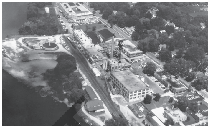
The former Wolverine World Wide tannery operations.

Many of the people we spoke with were very knowledgeable about the former tannery site and had an awareness of the site's history. Most of the residents have lived in the neighborhood for over 20 years and some of their family members worked at the former tannery. Some of the people interviewed have had some level of involvement with a local neighborhood group formed in response to the Wolverine Worldwide