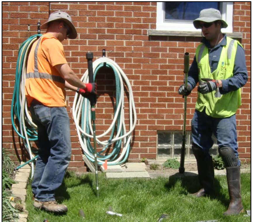
Hand sampling with an auger to clear utility lines. Sampling can also be done by Geoprobe (See photo on Page 2).

EPA recently sent out access agreements to property owners requesting permission for agency representatives and contractors to take soil samples from residential yards at NO COST to the property owner. EPA will collect samples at each residential property from approximately eight to 16 locations to a depth of 4 feet in the front and back yards, if applicable. All samples will be analyzed for PCBs. The sample holes will be about the size of a soda can. Grass and soil will be replaced, and care will be taken to leave each yard the way it was prior to sampling. None of this work can be done without property owner's written permission , so filling out and signing the access agreement is important. The property owner will be notified of sample results.