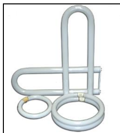
U-tube and Circline Lamps; Photo Source: Northeast Lamp Recycling, Inc.

Linear fluorescent, U-tube, and Circline lamps are used for general illumination purposes. They are widely used in commercial buildings, schools, industrial facilities, and hospitals.