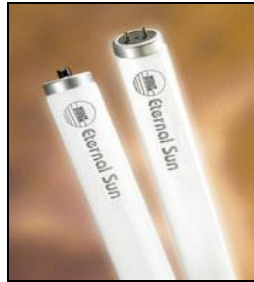
Tanning Lamps; Photo Source: Northeast Lamp Recycling, Inc.

Tanning lamps use a phosphor composition that emits primarily UV-light, type A (non-visible light that can cause damage to the skin), with a small amount of UV-light, type B.