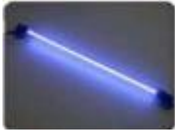
Neon Tube

Neon lights are gas discharge bulbs that commonly contain neon, krypton, and argon gasses (also called noble gasses) at low pressure. Like fluorescent bulbs, each end of a neon light contains metal electrodes. Electrical current passing through the electrodes ionizes the neon, and other gases, causing them to emit visible light. Neon emits red light; other gases emit other colors. For example, argon emits lavender and helium emits orange-white. The color of a “neon light” depends on the mixture of gases, the color of the glass, and other characteristics of the bulbs. Neon lights are estimated to contain approximately 250 to 600 mg of mercury per bulb, depending on the manufacturer’s preference.