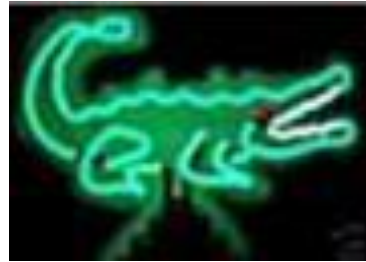
Neon Alligator Signage

Although the term “neon light” refers to all gas discharge bulbs using noble gases, regardless of the lamp color, only the red bulbs are true neon lights (i.e., use neon). Red neon lights do not contain mercury. Almost every other “neon light” color uses argon, mercury, and phosphor, in addition to other noble gases.