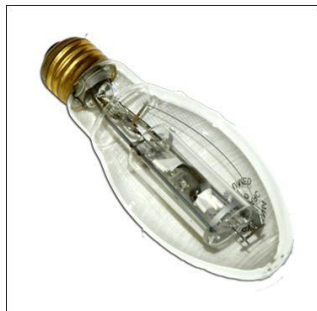
Metal Halide Lamp; Photo Source: Northeast Lamp Recycling, Inc.

the power level. According to NEMA, about one-third of these lamps sold in the U.S. contain greater than 100 to 1,000 mg of mercury.