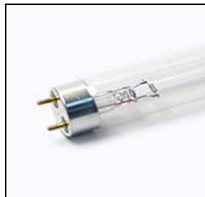
Germicidal Lamp; Photo Source: Northeast Lamp Recycling, Inc.

Germicidal lamps do not use phosphor powder and their tubes are made of fused quartz that is transparent to short-wave UV light. The ultraviolet light emitted kills germs and ionizes oxygen to ozone. These lamps are often used for sterilization of air or water.