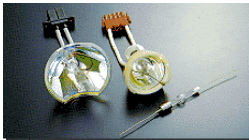
Mercury Short-Arc Metal Halide Lamp; Photo Source: Northeast Lamp Recycling, Inc.

relatively larger amounts of mercury, typically between 100 mg and 1,000 mg. Nearly a quarter of these lamps contain more than 1,000 mg of mercury.