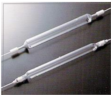
Mercury Capillary Lamps; Photo Source: Northeast Lamp Recycling, Inc.

Mercury capillary lamps provide an intense source of radiant energy from the ultraviolet through the near infrared range. These lamps require no warming-up period for starting or restarting and reach near full brightness within seconds. They come in a variety of arc lengths, radiant power, and mounting methods, and are used in industrial settings (i.e., for printed circuit boards), for UV curing, and for graphic arts. UV curing is widely used in silkscreening, CD/DVD printing and replication, medical manufacturing, bottle/cup decorating, and converting/coating applications. These specialized lamps contain 100 to 1,000 mg of mercury.