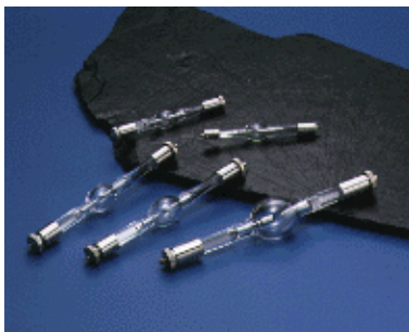
Mercury Xenon Short-Arc Lamps; Photo Source: Northeast Lamp Recycling, Inc.

Mercury xenon short-arc lamps operate similarly to mercury short-arc lamps, except that they contain a mixture of xenon and mercury vapor. They require a shorter warm-up period compared with regular mercury short-arc lamps, and they have better color rendering. They are used mainly in industrial applications. The mercury xenon short-arc lamps can contain anywhere between 50 mg and 1,000 mg of mercury. A small percentage of these lamps contain more than 1,000 mg of mercury.