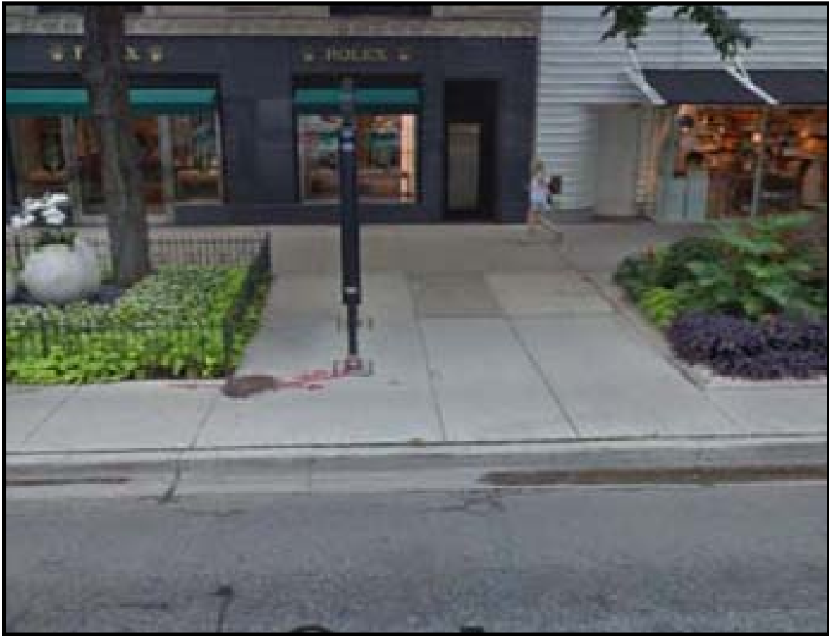
Photograph of information post prior to removal and excavation activities of July 27, 2017.