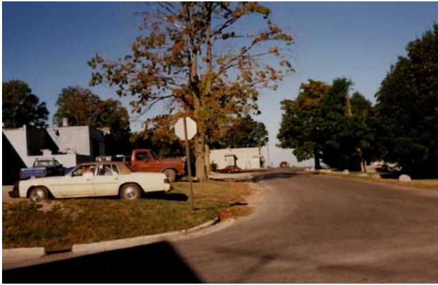
Water Street right-of-way before redevelopment.

Although some components were modified, the Waterfront Redevelopment Plan is currently in place as it was originally intended 25 years ago.