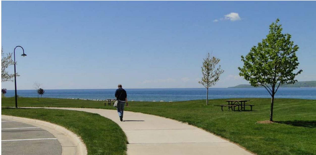
A visitor walking through Bayfront Park on the Little Traverse Wheelway

revitalization. The city recognized that the cleanup represented an opportunity to revitalize the downtown area in a way that was aligned with their long-term vision for the waterfront district. The city, in partnership with EPA and MDNRE, has realized their vision for restoring the natural setting along the lakefront, enhancing outdoor activities and bolstering the recreational culture of the area. Public and private investment in the area has significantly increased the number of visitors every summer that come to enjoy Petoskey's lakefront scenery and recreational amenities. Today, the financial rewards of this investment are great. The taxable value of the PMC Site is now almost $1.5 million, compared to $97,000 when the PMC facility was in operation.