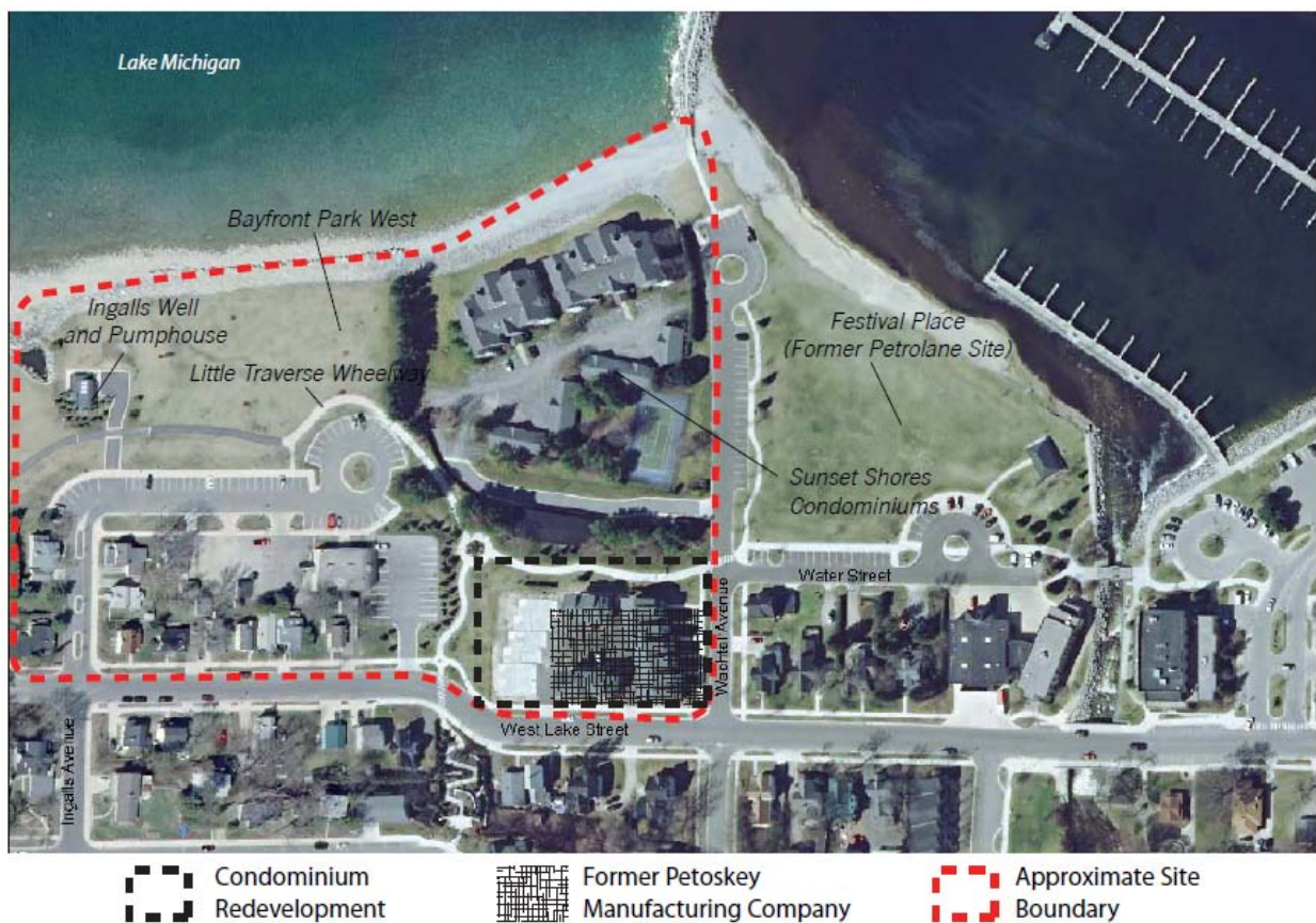
Figure 1: Site vicinity map

Located on the shores of Lake Michigan’s Little Traverse Bay, the City of Petoskey, Michigan is a vibrant community and popular resort surrounded by natural beauty and year-round recreation. The community is recognized nationally as a “best small town” and a “best place to retire”. The town has a well-established full-time population of about 6,000, but draws thousands of visitors every year to enjoy the lakefront scenery, festivals, recreation and the century-old buildings downtown. The city’s waterfront area has undergone a major transformation over the last twenty years from an industrial corridor to a welcoming public space, which has helped to boost the number of visitors that come to enjoy Petoskey. Part of this transformation was the cleanup and redevelopment of the PMC Groundwater Superfund Site (PMC Site or Site).