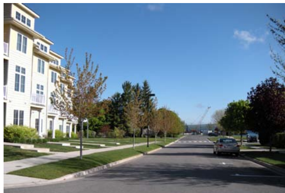
The Water Street condominiums with improved road (Wachtel Ave) and integrated utilities