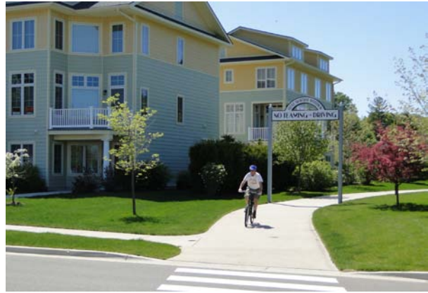
Water Street right-of-way redeveloped as a bicycle / pedestrian path called the Little Traverse Wheelway.