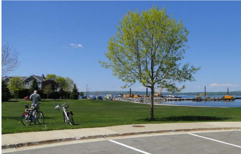
The former Petrolane Site is now a public park called Festival Place.

A proposal from a private developer provided the catalyst to initiate the first cleanup and redevelopment activities in the area. The developer saw residential potential in the former propane storage property, but was not willing to invest so long as the Petrolane manufactured gas plant remained in place across Wachtel Ave. The city submitted an offer to the Petrolane Company to move their facility. The offer consisted of a new 4-acre site south of town, construction of a new rail