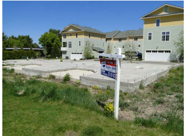
Vacant building pads serve as soil caps, an essential component of the site remedy