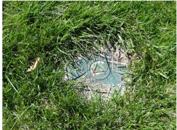
A flush mounted monitoring well located in Bayfront Park

With the known PMC soils having been addressed by SVE and excavation, EPA expected the residual contaminated ground water to naturally attenuate. A Preliminary Close-Out report was signed on February 18, 2000 indicating the remedial construction activities were complete at the Site. With construction complete and ICs in place, EPA declared the PMC Groundwater Site as Site Wide Ready for Anticipated Reuse (SWRAU) on December 17, 2007.