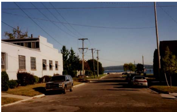
The former PMC facility

After resources available from the state and EPA for cleanup were exhausted, and monitoring wells were all that remained on the Site, the city formed a local Brownfield Redevelopment Authority (BRA) to