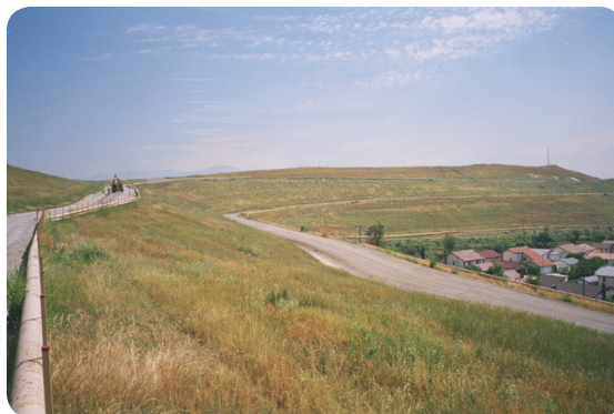
Spring grasses grow on the cap of a hazardous waste landfill.

Capping is the traditional method for isolating landfill wastes and contaminants. It sometimes is used to address large volumes of soil or waste with low-levels of contamination. Caps made of asphalt or concrete, or even a layer of soil planted with grass, can allow some sites to be reused. Caps have been selected for use at many Superfund sites across the country.