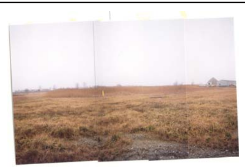
All identified waste has been removed from the Augustus Hook site.

The RfR Determination for the Augustus Hook site is based on the 1996 Initial POLREP, the 1997 Final POLREP, and the1990 RI for the Site. According to the 1997 POLREP, all hazardous materials on site were treated and shipped off site. A total of 64,405 tons of lead-contaminated soil were treated and disposed of off site, over 1.3 million gallons of water were treated and