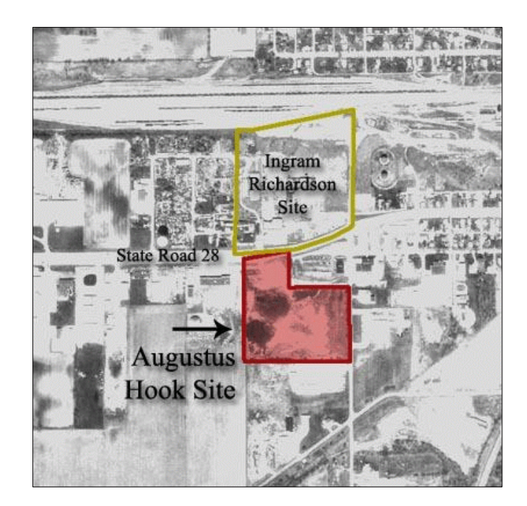
Exhibit 2. Augustus Hook Site Map, showing surrounding area