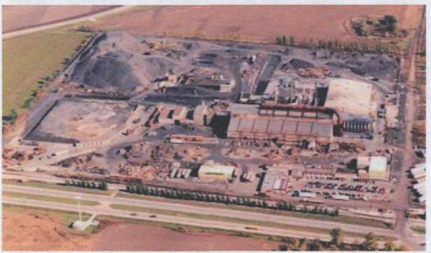
Photograph is an aerial image of the Chemetco site.

Chemetco was a former secondary copper smelting facility which operated from 1969 to 2001. The company owned more than 230 acres of land; however, the smelting operation occupied only about on 41 acres of the property. The Chemetco Superfund site is located in Chouteau Township, just south of the Village of Hartford, in Madison County, Illinois (see figure on next page). The site of the smelting operation originally contained a foundry, a tank house, several other industrial buildings, a receiving building, a laboratory, commercial offices, plant offices, a mobile shop and industrial smoke stacks in disrepair. By June, 2011, the site's huge tank house had been gutted, piping structures demolished and much metal scrapped. The last standing smoke stack collapsed in 2010. The 41-acre property is currently fenced and access to the site is restricted by order of the Illinois EPA.