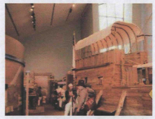
55 foot long replica of the keelboat Lewis had built in Elizabethtown, Ohio

The Lewis & Clark Illinois State Historic Museum is also located in Hartford, Illinois, and is northwest of the Chemetco site. The facility is operated by the Illinois Historic Preservation Agency and is designated as Site #1 on the Lewis and Clark National Historic Trail. It features the Lewis and Clark Interpretive Center, a 15,000 square foot brick and cedar building that tells the story of how the Corps of Discovery assembled equipment, supplies and men at Camp River Dubois.