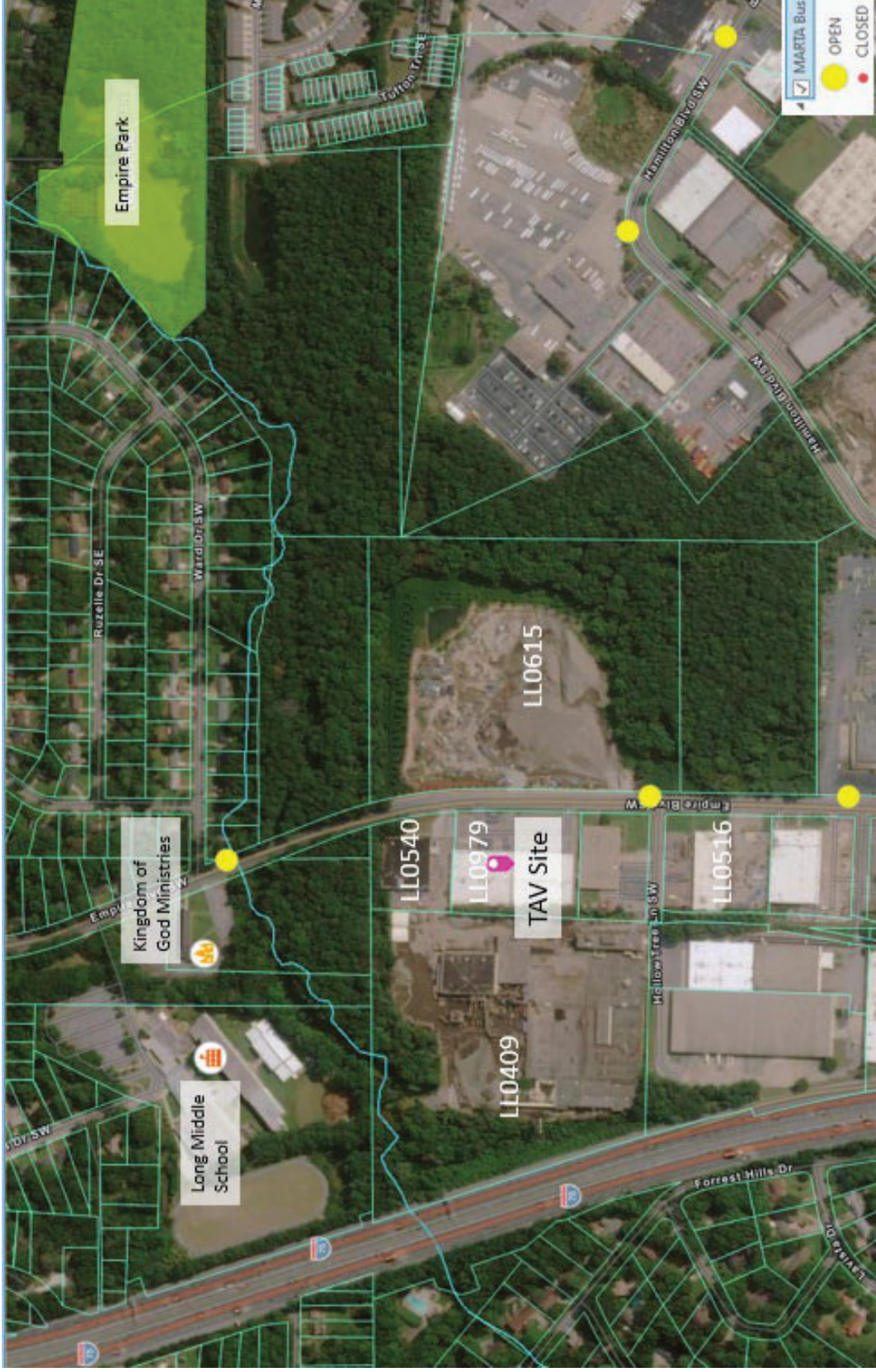
Figure 1: Satellite Image of TAV Holdings and Surrounding Area with Parcel Numbers and Other Features