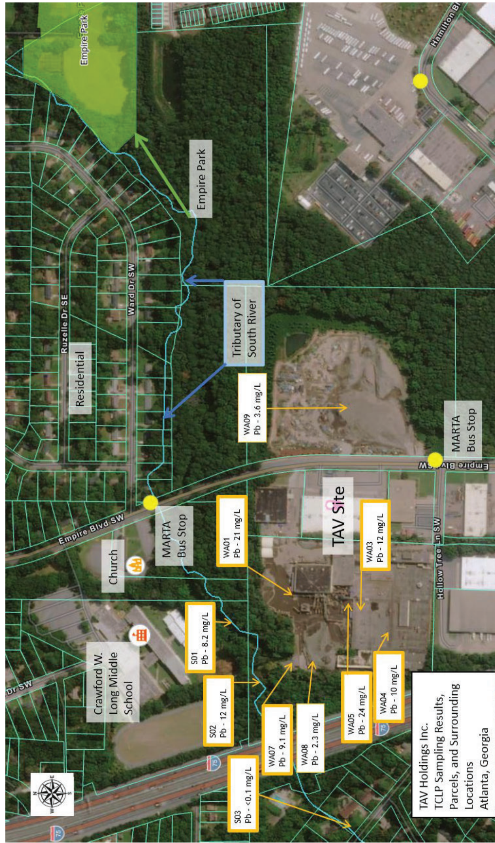
Figure 3: Google Maps Image of TAV Facility with TCLP Results, Parcels and Surrounding Locations