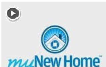
Get the Facts on Buying vs Renting YouTube