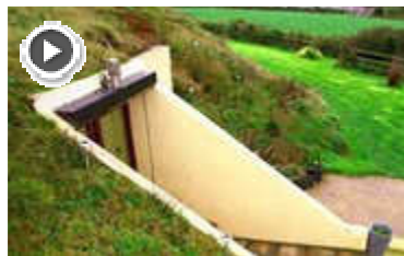
Bunker Living in Modern World uLive