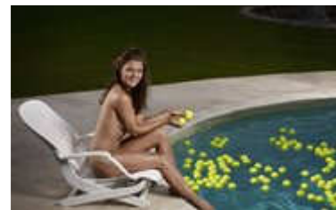
Athletes Bare All For ESPN's The Body Issue The Fumble