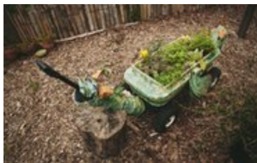
15 Crazy Container Gardens HGTV Gardens