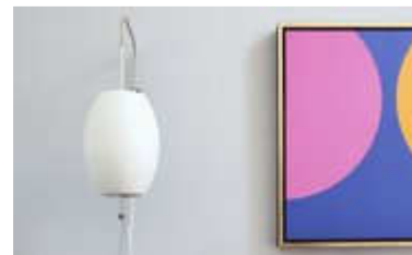
Small Bedroom Decorating Solutions HGTV