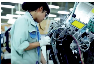
GE Healthcare's Hino factory has been applying lean for decades, now using software like GE Digital's Proficy™ Operations Hub to digitally transform its operations. The site was recognized by the World Economic Forum in 2020 as one of the world's most advanced manufacturing sites.

Broadly, though, Renewable Energy's performance was mixed. I think about the dynamics at play in Renewable Energy in three parts. First, Onshore Wind is our most established, profitable business, and it is meeting high customer demand and growing internationally. Second, we're placing technology bets in fast-growing markets. In October, for example, Offshore Wind successfully installed the prototype for the Haliade™-X, which already is breaking records for power production by a wind turbine. Third are our required turnarounds in Grid Solutions and Hydro. Improving project underwriting and daily execution here will be a major focus for us in 2020.