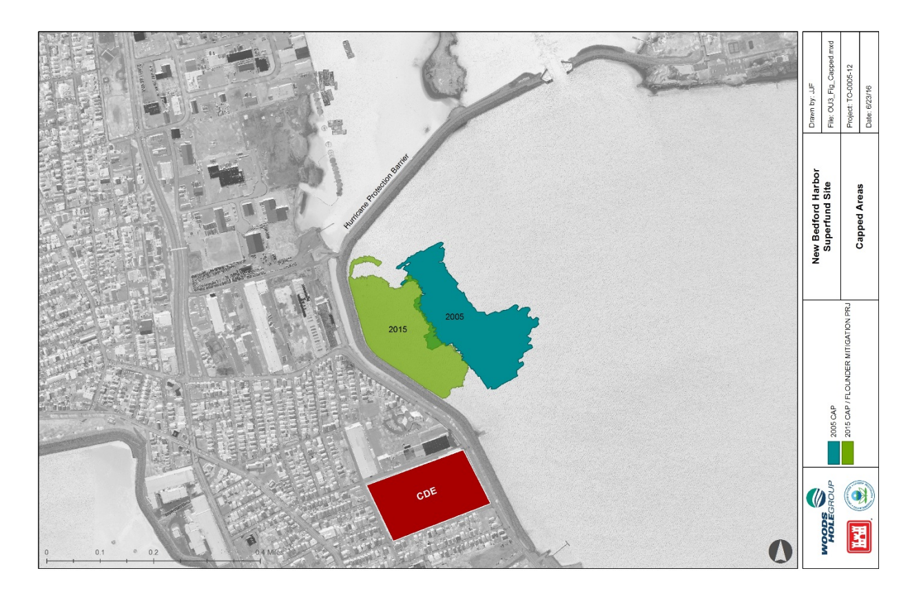
Figure 2. 2005 and 2015 Cap Footprint Areas