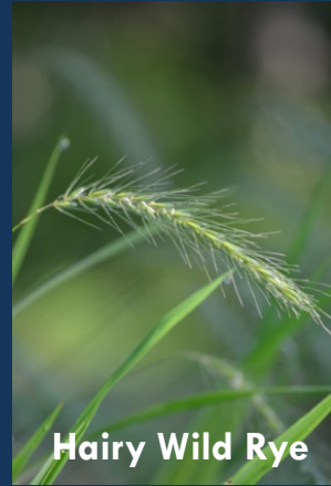
Hairy Wild Rye