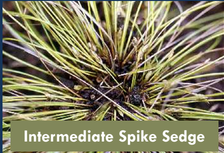
Intermediate Spike Sedge