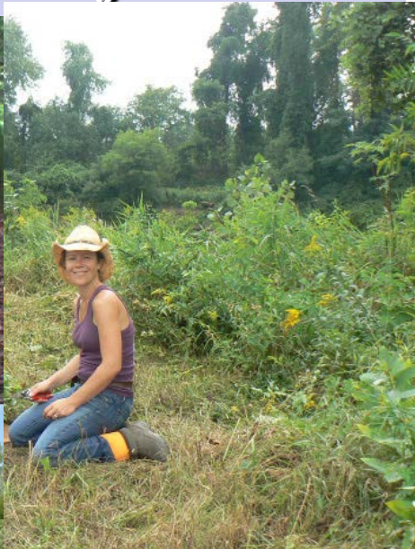
Waypoint #5 Brownson cleanup