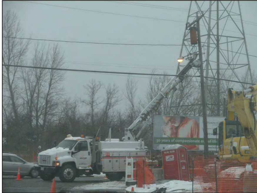
Photograph 37: Utility management during soil removal activities (3/19/13)