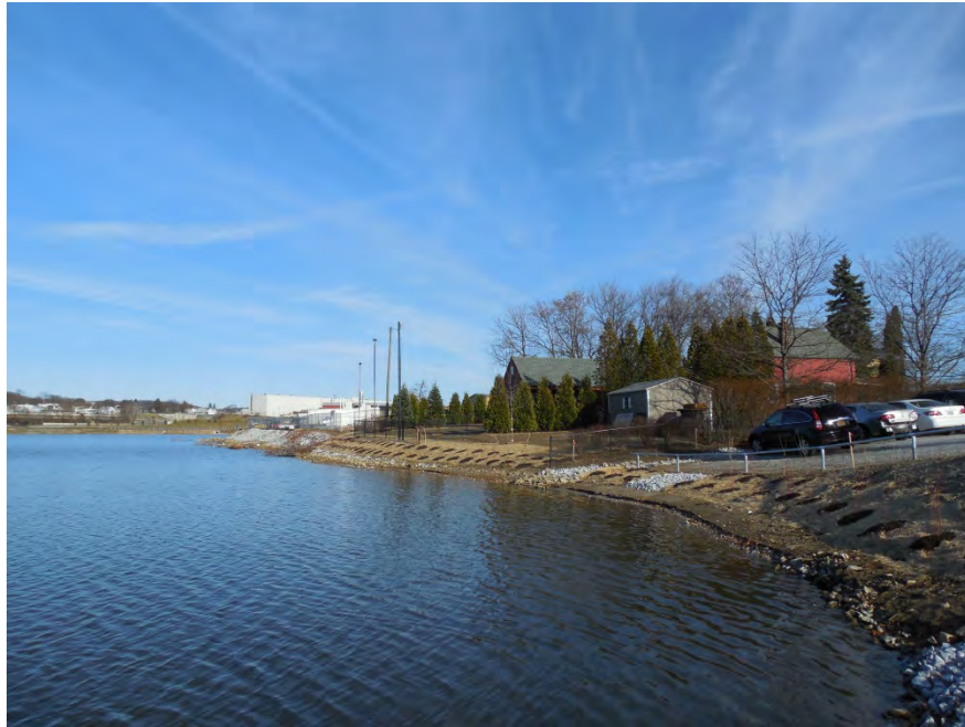
Á Photograph 66: Restored private parcels (11/20/13)