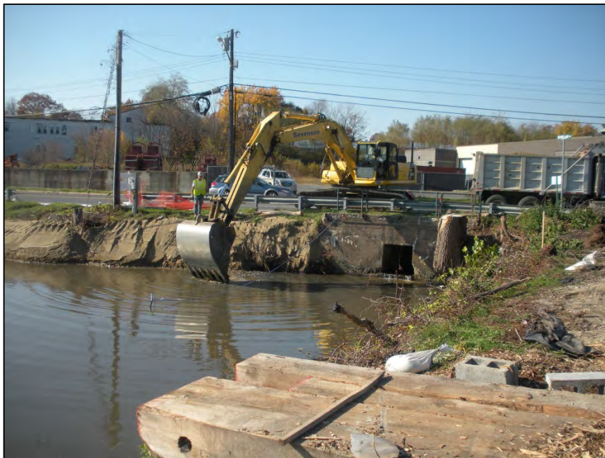
Photograph 12: Near-shore sediment removal near Fourth Street Outfall (10/26/12)