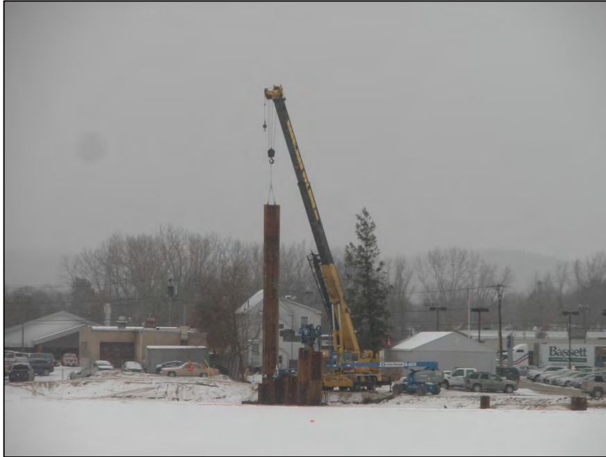
Photograph 29: Installation of sheetpile for soil removal activities (1/28/13)