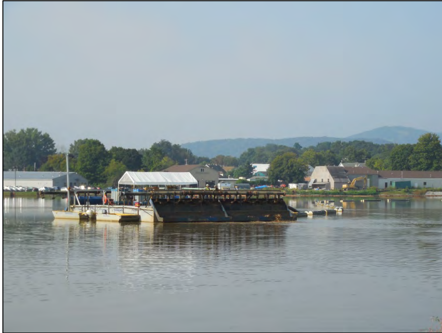
Photograph 54: Installation of geotextile fabric and armor stone in channel (9/19/13)