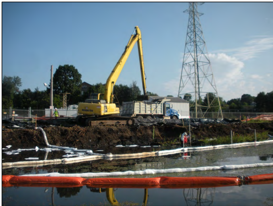
Photograph 4: Soil removal activities (Polygon 5) (8/16/12)