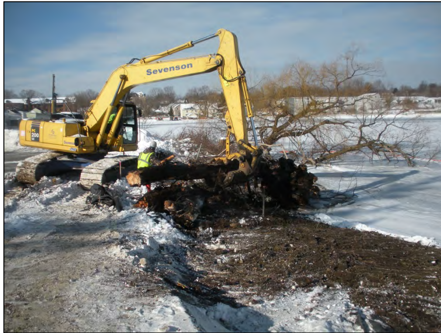
Photograph 28: Verification of thickness of near-shore restoration layer(s) (1/17/13)