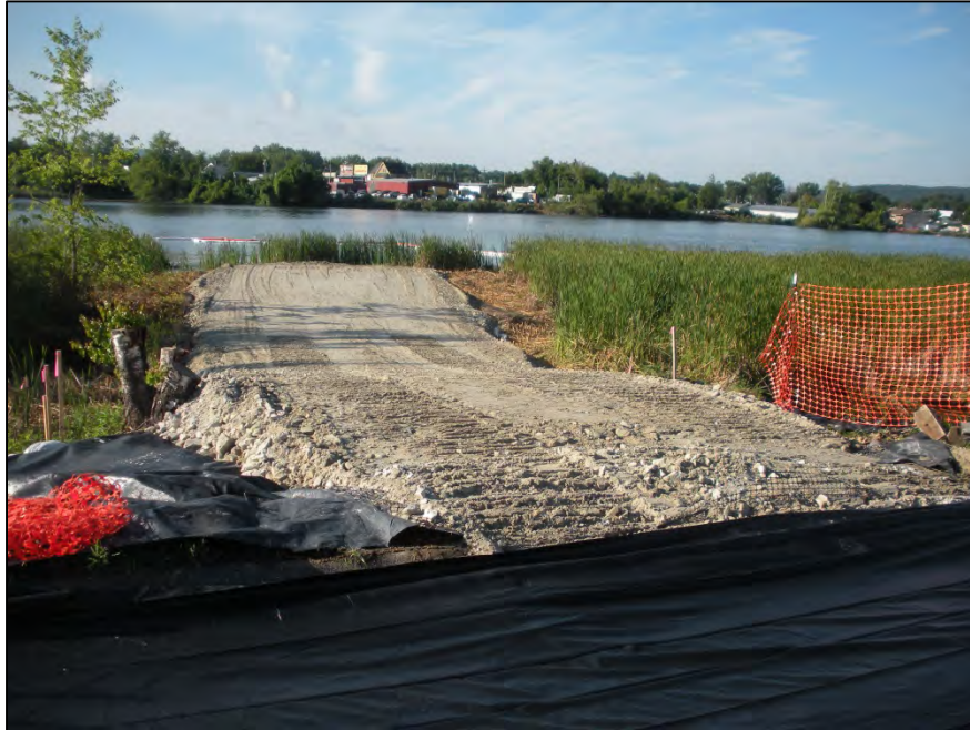
Photograph 7: Construction of access road on Shrub-Scrub Island (8/21/12)