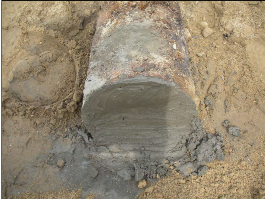
Photograph 9: Decommissioned 12-inch cast iron pipe discovered in Polygon 5 (9/6/12)