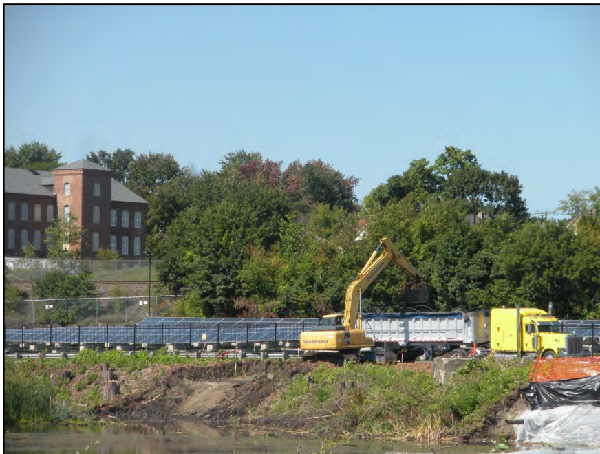
Photograph 10: Direct loading of excavated materials during soil removal activities (9/13/12)