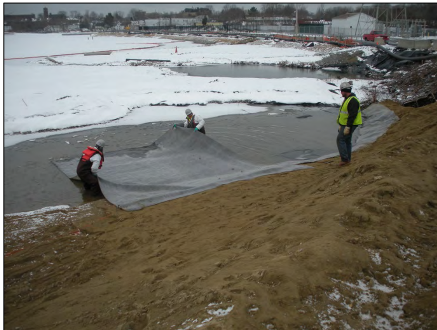
Photograph 38: Installation of geotextile fabric for near-shore area restoration (3/22/13)