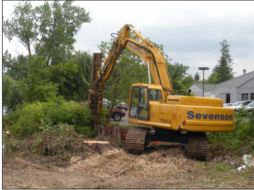
Photograph 2: Installation of sheetpile weir/stop log structure Housatonic River Outfall (7/18/12)

Á Á Á Á Á Á Á Á Á Á Á Á Á Á Á Á Á Á Á Á Á Á