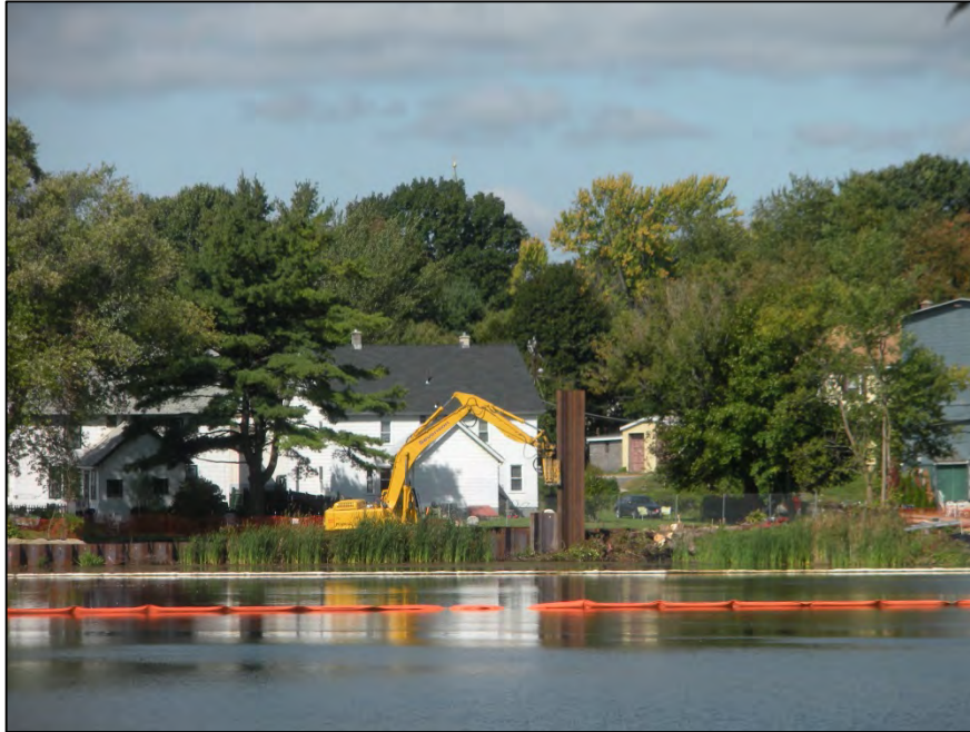
Photograph 11: Installation of sheetpile for soil removal activities (9/22/12)