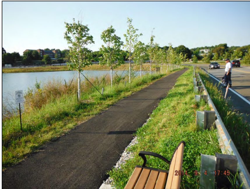
Photograph 72: Walking path and bank vegetation in northwest portion of lake (9/4/14)