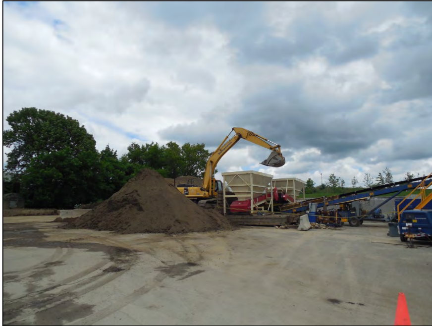
Photograph 52: Walking path subgrade preparation (7/25/13)