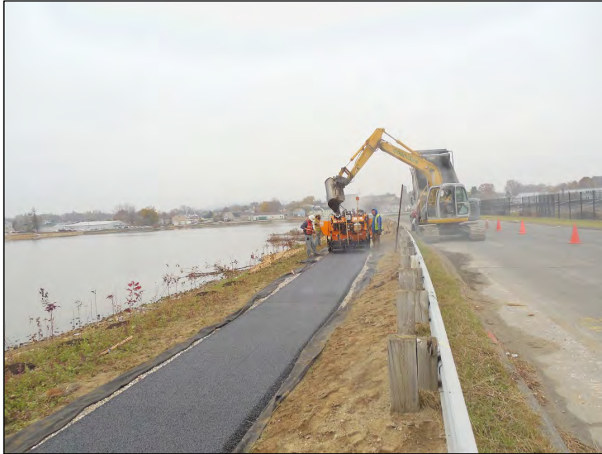
Photograph 62: Installation of plantings along the walking path (11/4/13)