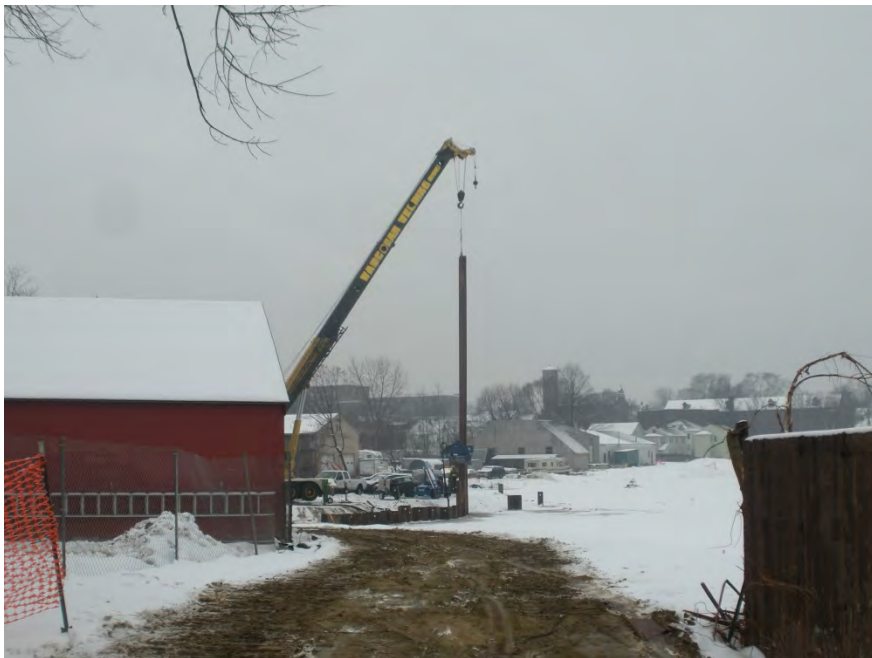
Photograph 30: Installation of sheetpile for soil removal activities (1/29/13)