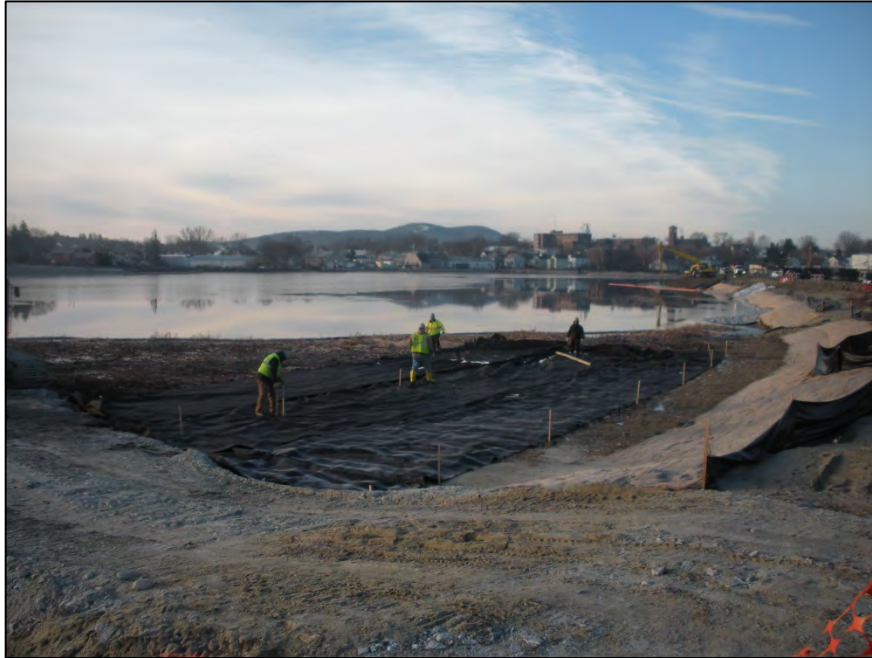
Photograph 24: Installation of cap and topsoil material on Shrub-Scrub Island (12/12/12)