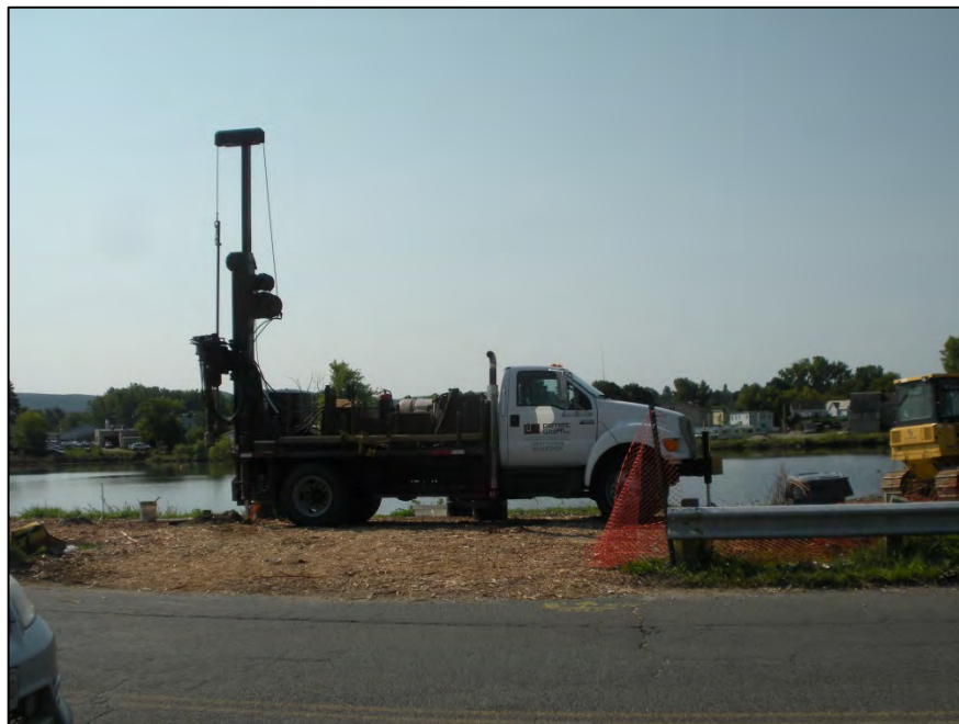
Photograph 8: Decommissioning monitoring wells (8/31/12)