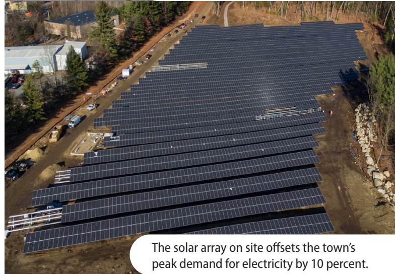
The solar array on site offsets the town's peak demand for electricity by 10 percent.