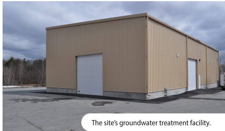
The site's groundwater treatment facility.

The project illustrates how local governments and citizens can play a leading role in Superfund redevelopment. It also highlights how Superfund sites can host several reuses that address multiple community needs. Looking forward, the town of Concord has built a strong foundation for maximizing community-wide benefits from the area's once-contaminated industrial lands.