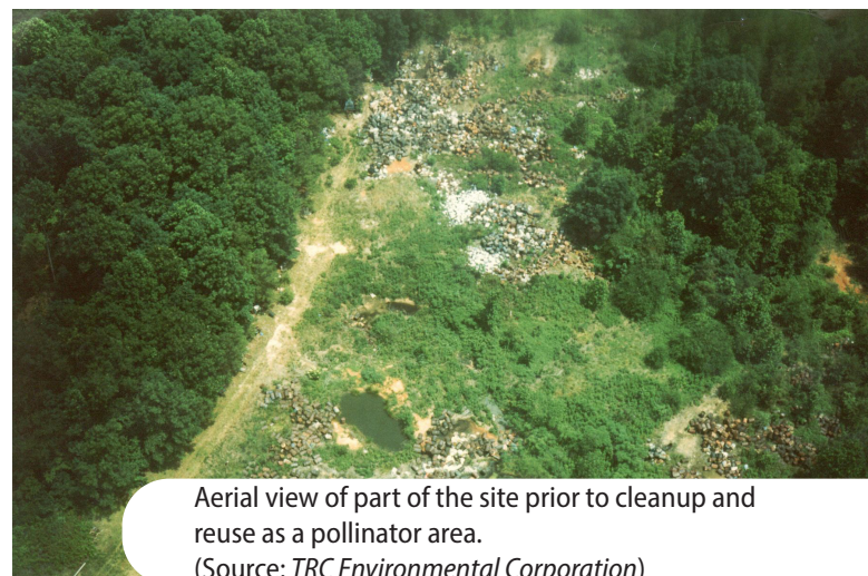
Aerial view of part of the site prior to cleanup and reuse as a pollinator area.

The site's successful cleanup and reuse shows how effective partnerships and collaboration between diverse site stakeholders can transform formerly contaminated Superfund sites into areas that provide significant environmental and public health benefits. In this case, a pollinator area now provides valuable habitat for native pollinators, plants and wildlife in an area that was previously characterized by industrial waste disposal and contaminated soils.