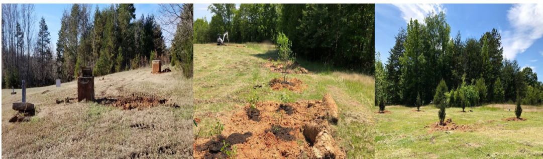
The former on-site soil treatment system (left), planting of a portion of the pollinator habitat on site (center), view of the pollinator habitat (right).

For more information see: www.epa.gov/superfund-redevelopment