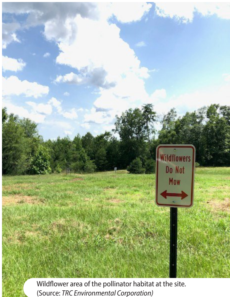
Wildflower area of the pollinator habitat at the site.