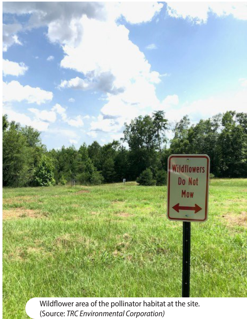
Wildflower area of the pollinator habitat at the site.

100 Million gallons of contaminated groundwater treated