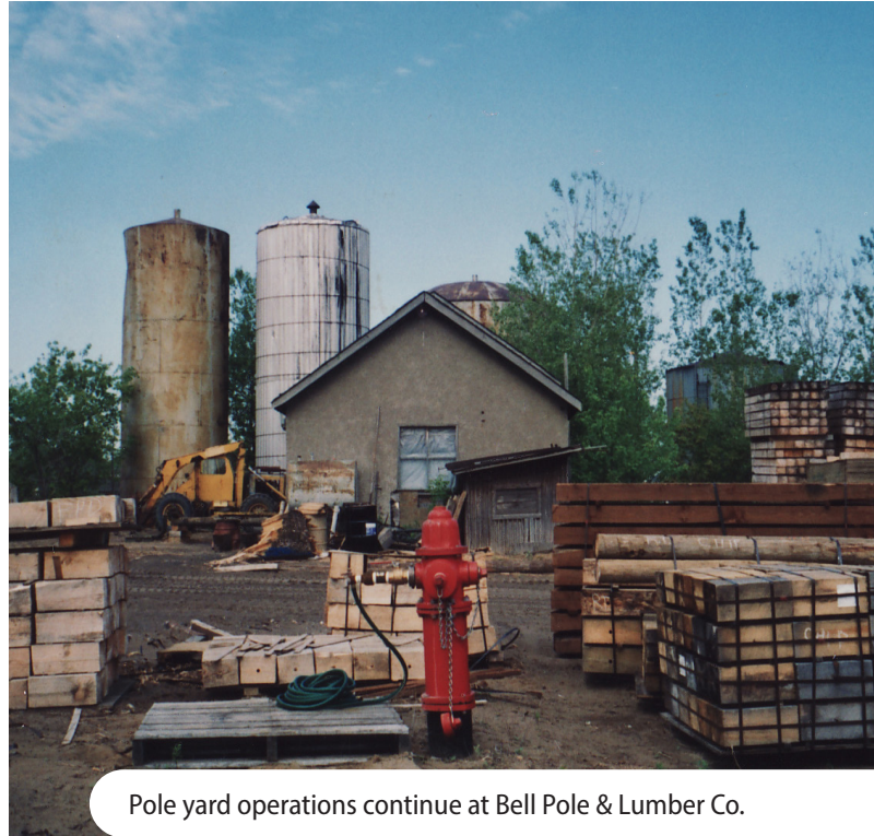
Pole yard operations continue at Bell Pole & Lumber Co.