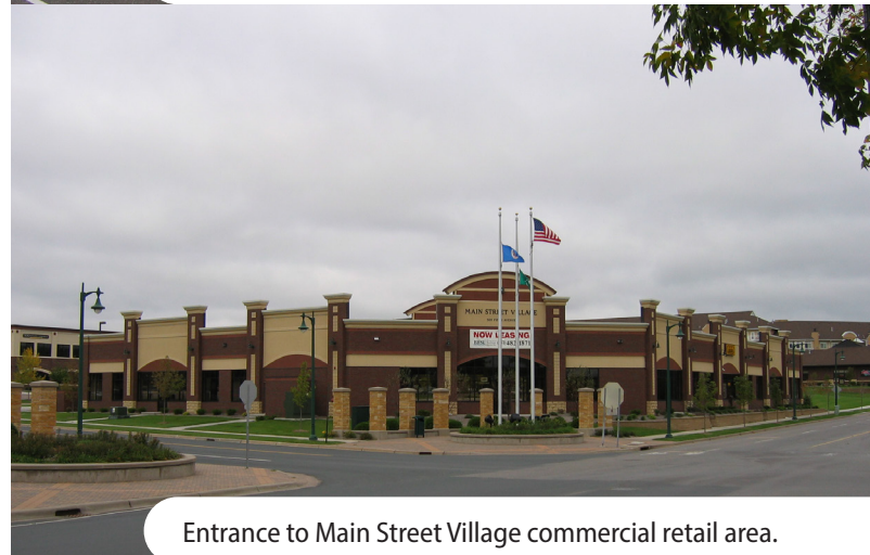
Entrance to Main Street Village commercial retail area.