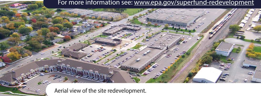
Aerial view of the site redevelopment.

For more information see: www.epa.gov/superfund-redevelopment