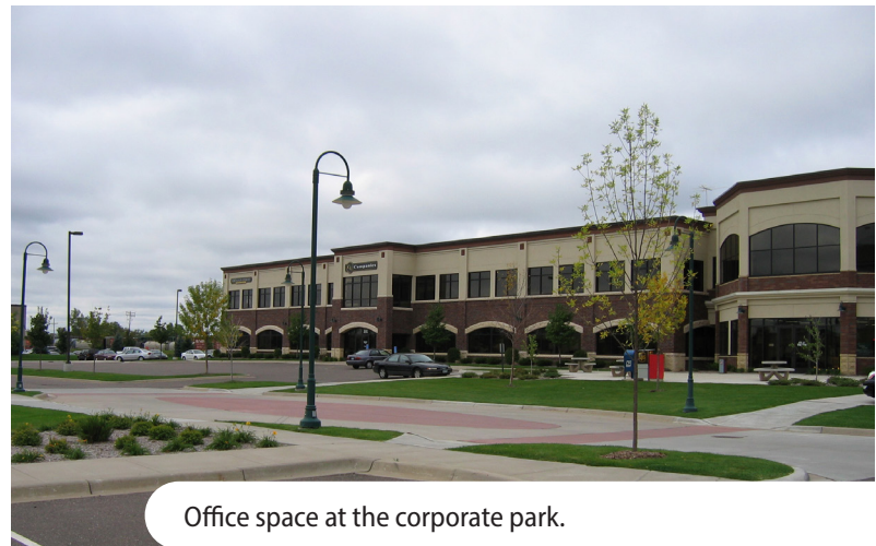
Office space at the corporate park.

Since the mid-1980s, the city of New Brighton (the City) had been laying the groundwork necessary to redevelop the 25-acre MacGillis & Gibbs property as part of its plan to revitalize a historic road that was once a main route through the Minneapolis–Saint Paul metropolitan area. In 1997, the City, along with state and federal agencies, successfully negotiated a prospective purchaser agreement to resolve the City's liability concerns about obtaining the property. Soon after, the City acquired the property by using eminent domain. This enabled the site's cleanup and redevelopment to move forward, resulting in the 32-acre New Brighton Corporate Park III.